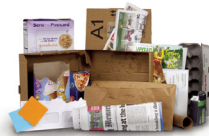
MIXED PAPER, MAGAZINES, NEWSPAPER AND BOXES Empty and flatten