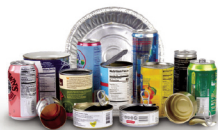
FOOD AND BEVERAGE CANS Empty and rinse