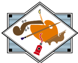
Arts & Communications