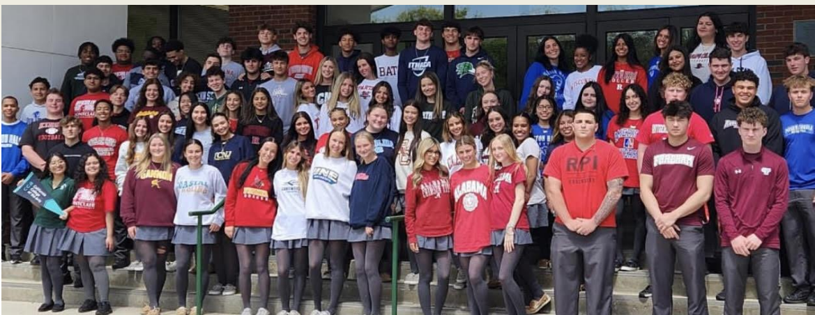
The Class of 2025 – Congratulations and Good Luck to all the Graduates!