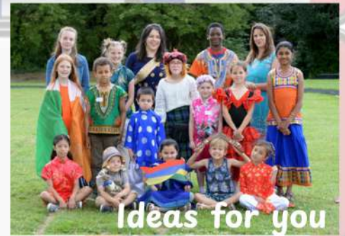
Ideas for you

Children will have the chance to visit one of the 6 countries.