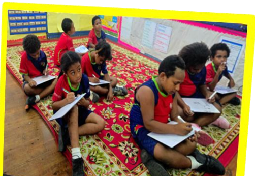
Targeted support is given to deepen understanding ( Return ).