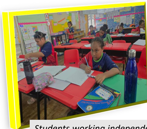
Students working independently on differentiated activities.