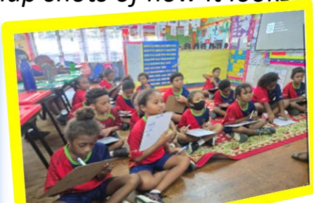
Students practice it independently ( Release )