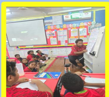
Teacher models the method ( Launch )

The lesson follows an interactive teaching model: the teacher models the method ( Launch ), students practice it independently ( Release ), and then targeted support is given to deepen understanding ( Return ). Students also work on differentiated activities that connect to real-life situations, helping them build confidence with larger numbers and organise their thinking neatly. Below are few snap shots of how it looks like in our Maths Lesson.