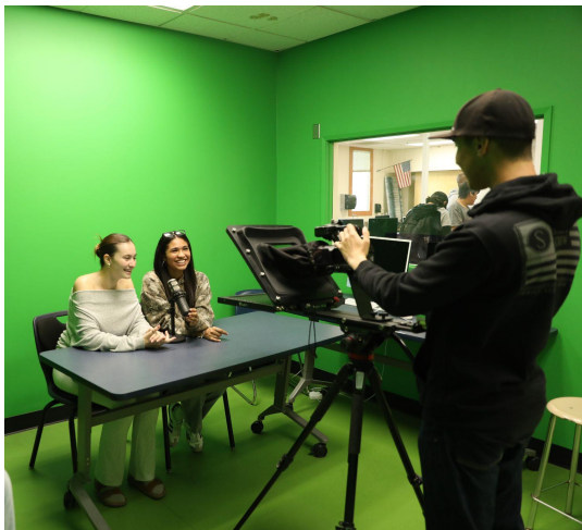
FILM, TV, & VIDEO PRODUCTION