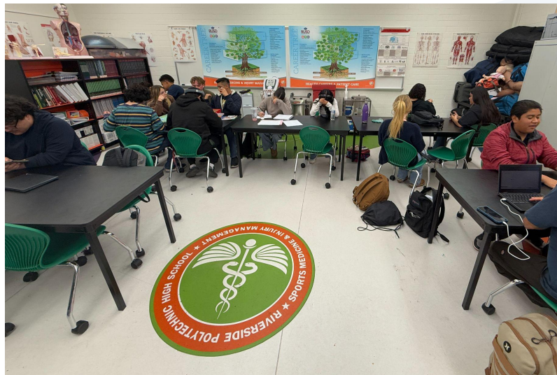
SPORTS MEDICINE & INJURY MANAGEMENT