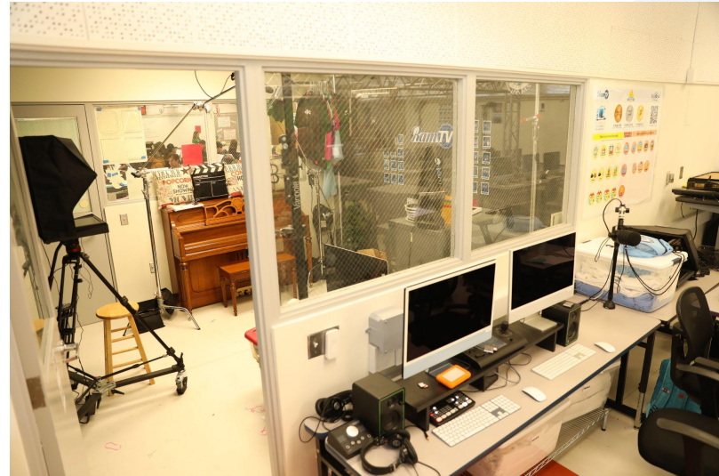
FILM, TV, & VIDEO PRODUCTION