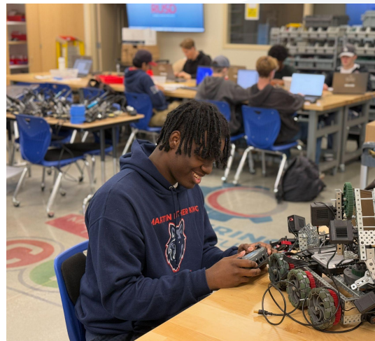
ENGINEERING & ARCHITECTURE