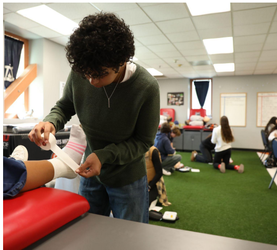
SPORTS MEDICINE & INJURY MANAGEMENT