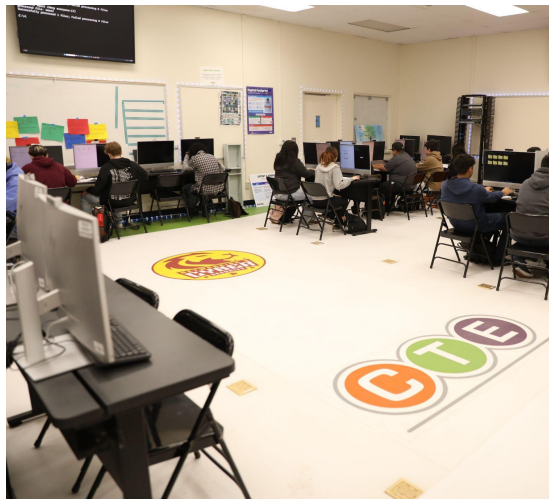
NETWORKING & CYBERSECURITY