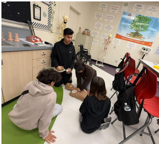
HEALTH CAREERS & PATIENT CARE