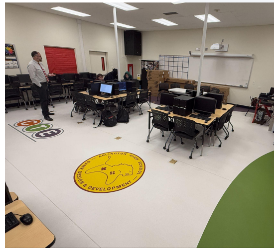
GAME DESIGN & DEVELOPMENT