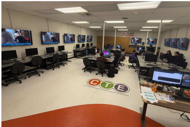
GAME DESIGN & DEVELOPMENT