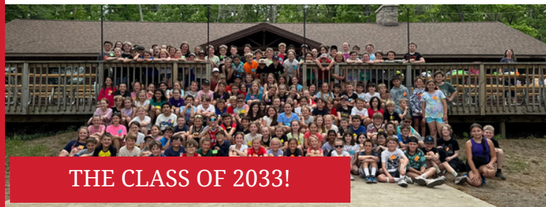
THE CLASS OF 2033!

These experiences are more than events; they’re signals to our students that they are seen, supported, and not alone in the journey ahead. Transitions don’t have to be scary. At SLPS, they’re designed to be a bridge—built with care—toward the next step in the student journey.