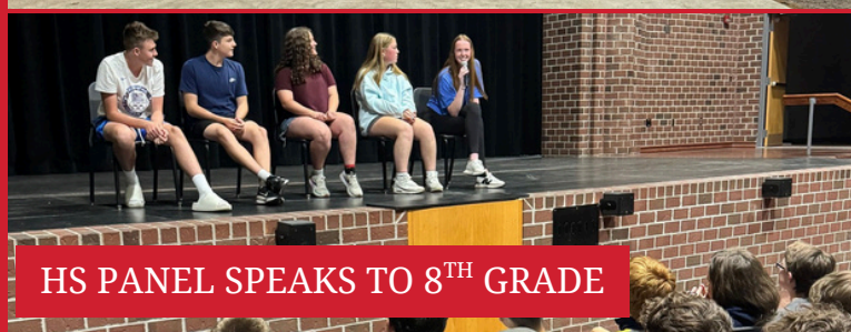
HS PANEL SPEAKS TO 8 TH GRADE