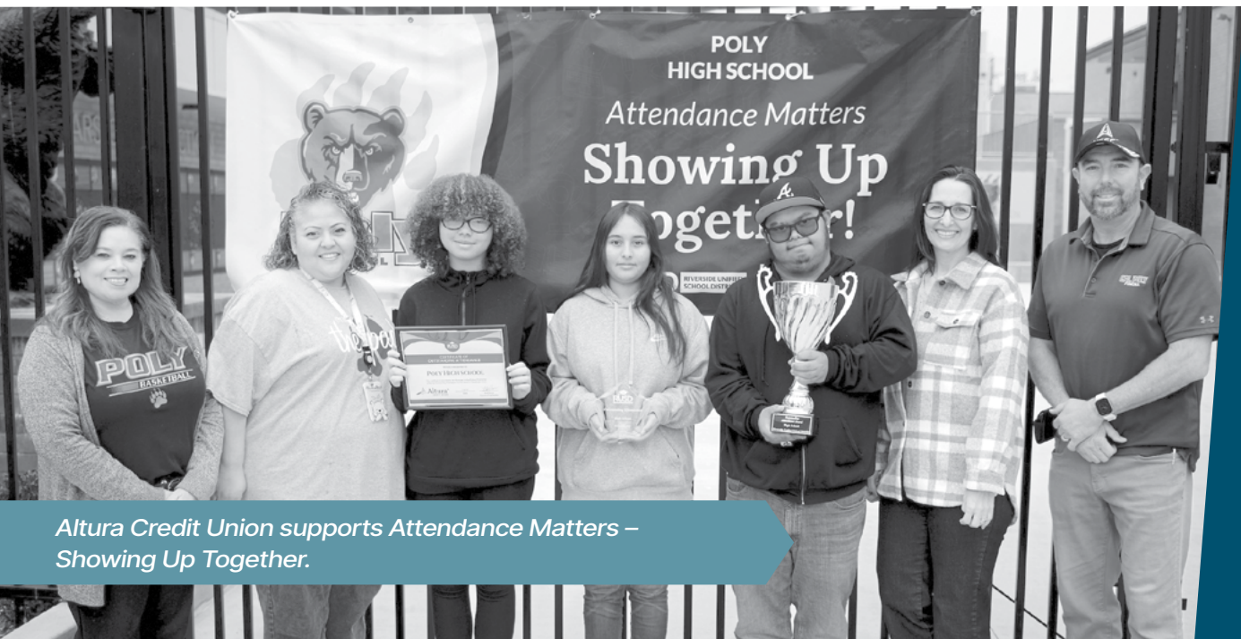
Altura Credit Union supports Attendance Matters – Showing Up Together.

By providing assistance, the Foundation offered a lifeline to families facing financial hardship, ensuring every student has the essential support they need to attend school daily. We extend our sincere thanks to the Albert B. Cutter Fund Foundation for their generous contribution. Your support has made a significant difference in the lives of these families and their ability to ensure their children can attend school with the necessary resources.