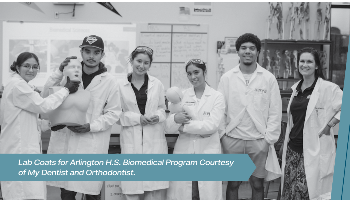
Lab Coats for Arlington H.S. Biomedical Program Courtesy of My Dentist and Orthodontist.

Community collaborative efforts are crucial in supporting the RUSD Foundation's mission to foster student success and empower young minds to achieve their fullest potential. Throughout the 2023-2024 school year, the Foundation led a series of transformative initiatives aimed at enriching student lives across our community. These efforts range from recognizing academic excellence and supporting neurodiverse students in music to celebrating athletic triumphs and facilitating seamless transitions to higher education. By providing these invaluable opportunities, together, we are shaping the future leaders of tomorrow. Through unwavering commitment and the strong support of our community, the RUSD Foundation is able to pave pathways for student achievement and resilience, which would not be possible without the steadfast support of our community.