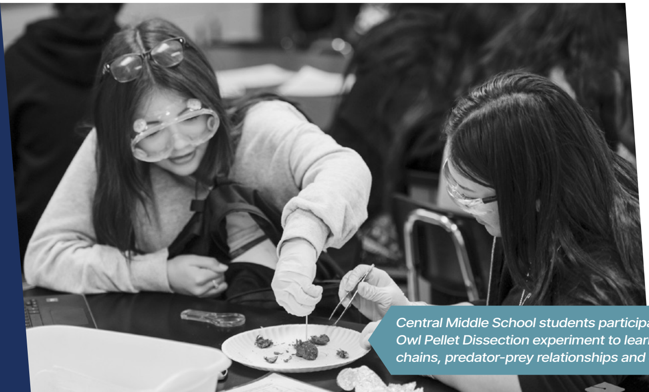
Central Middle School students participate in the Owl Pellet Dissection experiment to learn about food chains, predator-prey relationships and ecosystems.