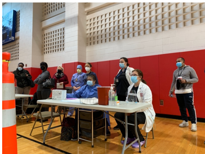
PPS school nurses listen to training guidelines

partnership with the City of Paterson's Department of Health and Human Services, and the effort is part of the State of New Jersey's COVID-19 vaccination program.