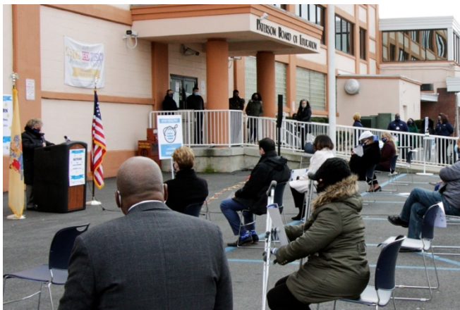
Local officials gather at a local control press event.

Paterson Public Schools earns local control ending 30-year state takeover