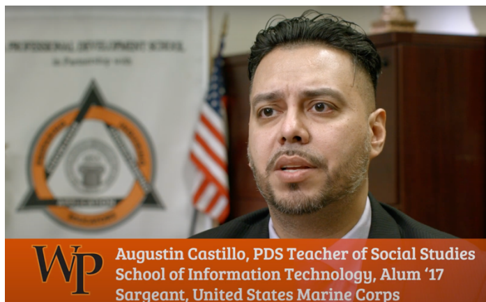
Scene from Veterans In The Classroom

We're looking for a few good men and women.