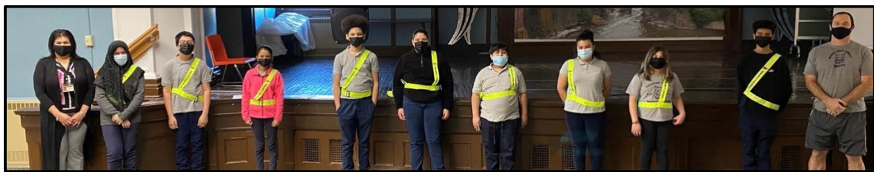
Members of the School 7 Safety Patrol and their faculty advisors.