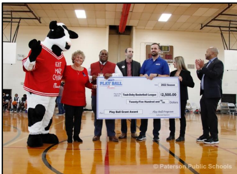
The halftime presentation of the $2,500 grant award to the Taub-Doby League