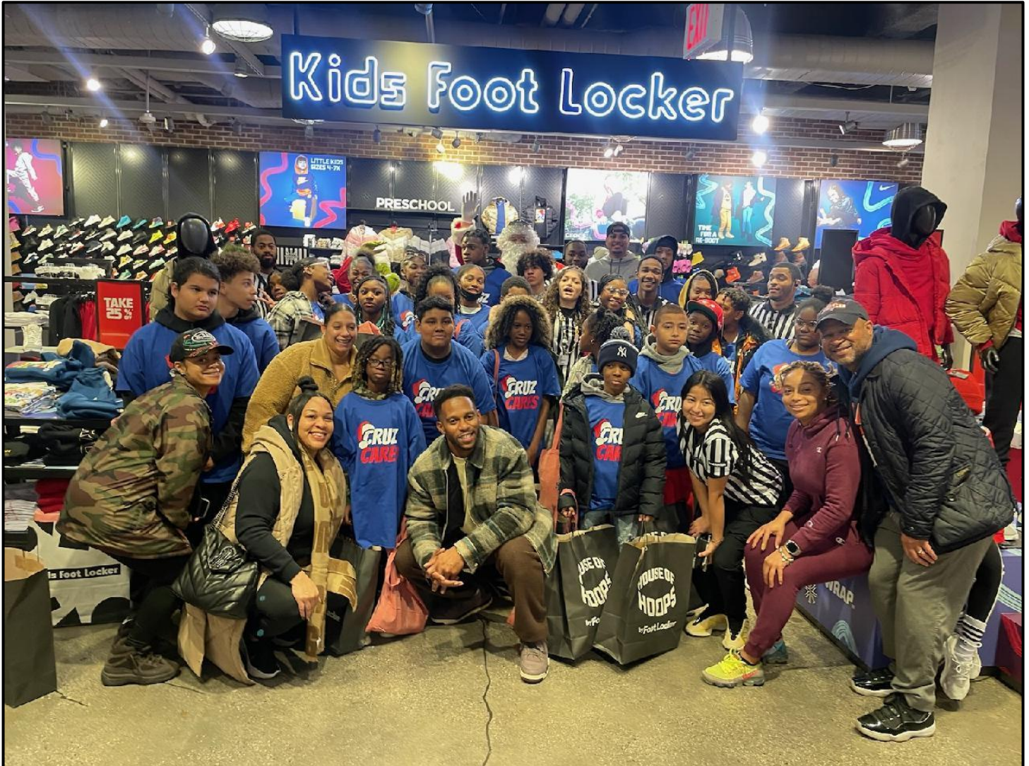
Former New York Giant Victor Cruz, center, with School 21 students, staff, and friends.

Super Bowl Champion and Paterson Native Victor Cruz made it a very happy holiday season for 25 students who attend Public School No. 21 by taking them all on a holiday shopping spree on Dec. 18 th .