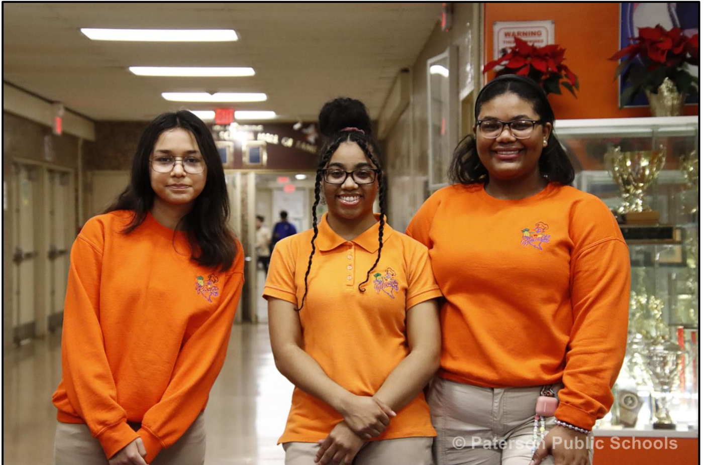
Essay contest winners at Eastside High School.