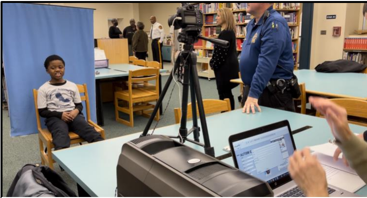
A School 2 student gets his photo taken for a new ID.

“We hope this gives the parents of these children a little more peace of mind,” he said. “This initiative also gives the school district and parents more information to share with law enforcement in case of an actual emergency.” CLICK HERE to see TAP’s story on this topic.