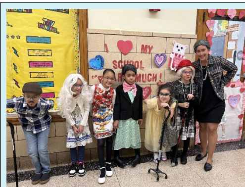
School No. 18