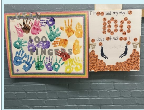
School No. 25