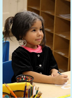
School No. 2