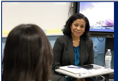
Newcomers High School