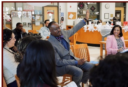
International High School