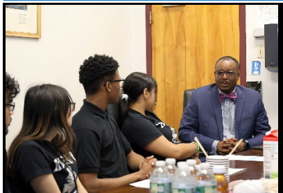
John F. Kennedy High School