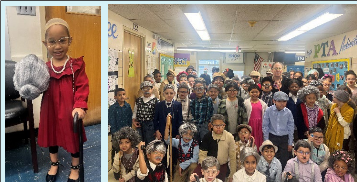
School No. 27