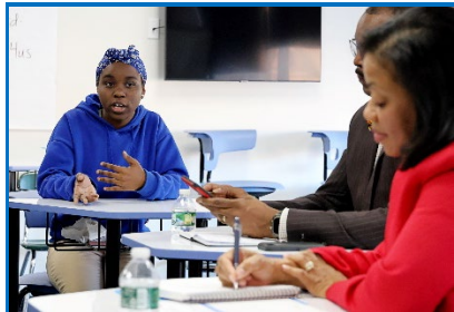
Paterson STEAM High School