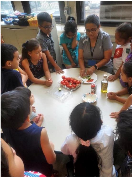
Students had the opportunity to eat some tomatoes and cucumbers.