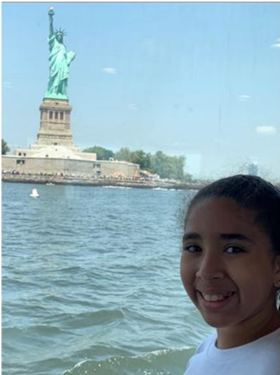
It was rewarding to see the students faces light up when they went on the boat trip to the NY Circle Line.