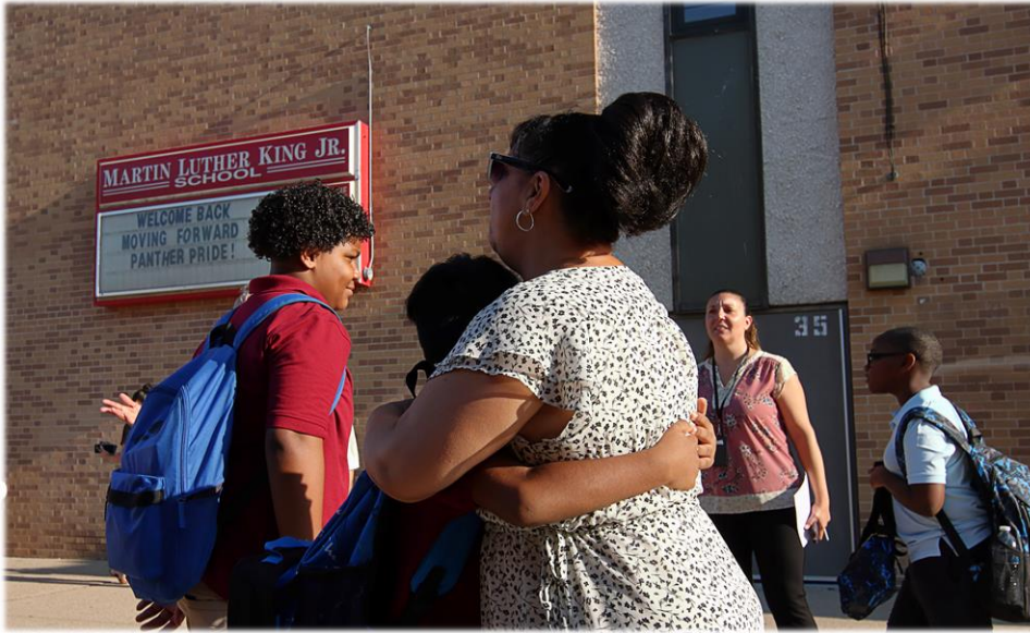
Staff from School No. 3 greet their students as they get off the bus at MLK.