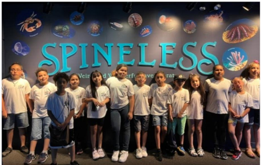
On their last excursion, students had a blast at the NY Aquarium.