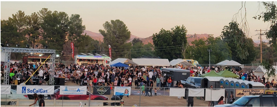
Photo of Sweetwater Festival