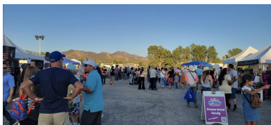
Photo of the Sweetwater Festival