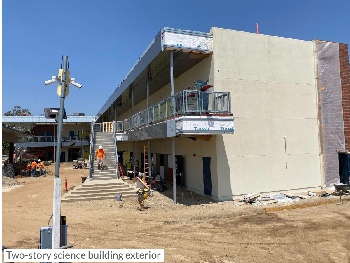
Two-story science building exterior