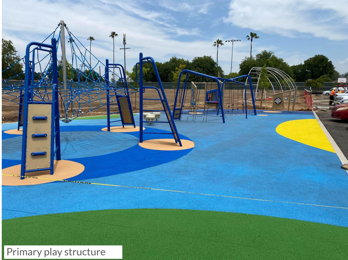
Primary play structure