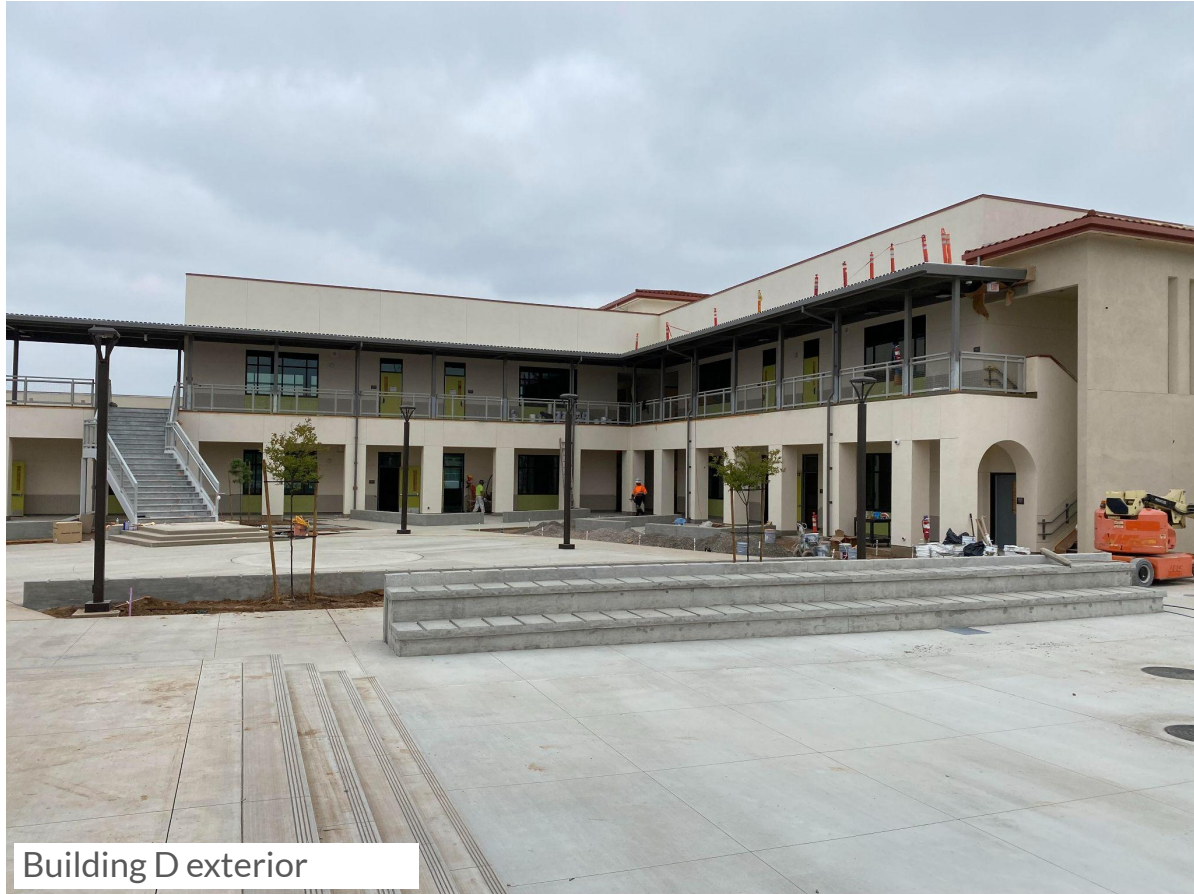
Building D exterior