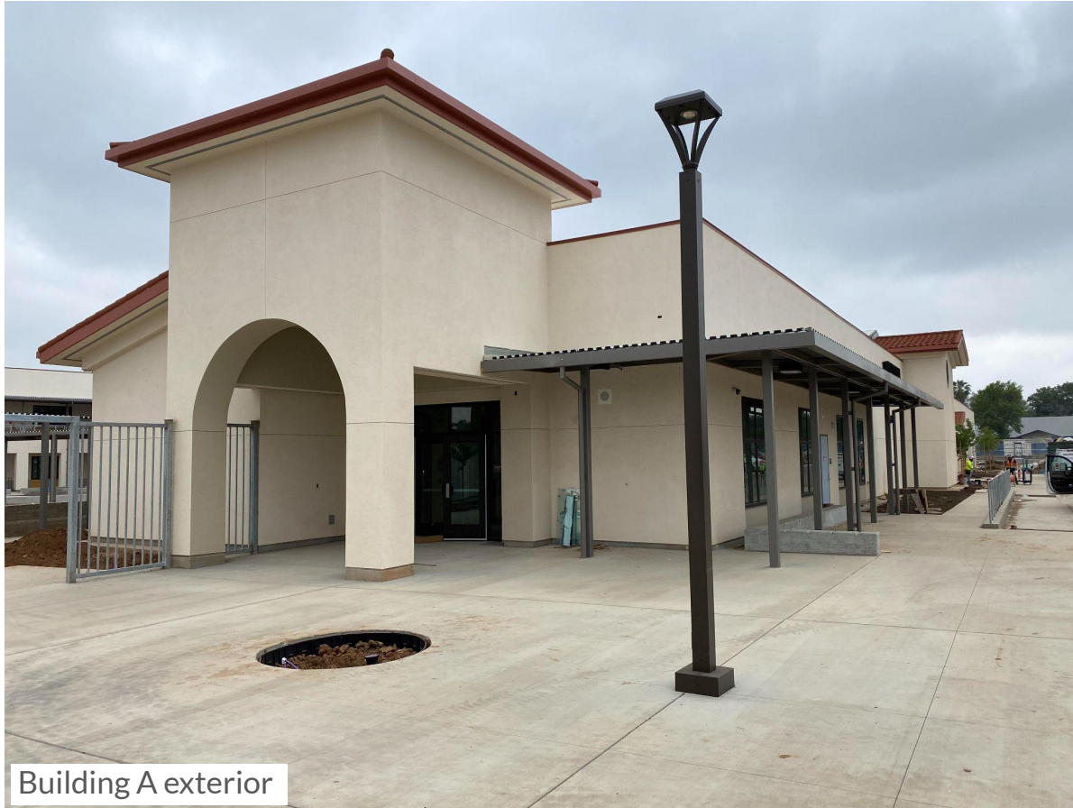
Building A exterior