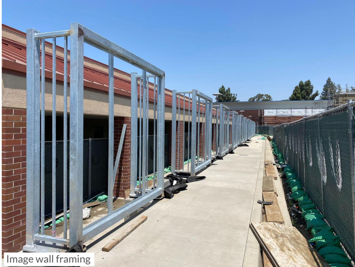
Image wall framing