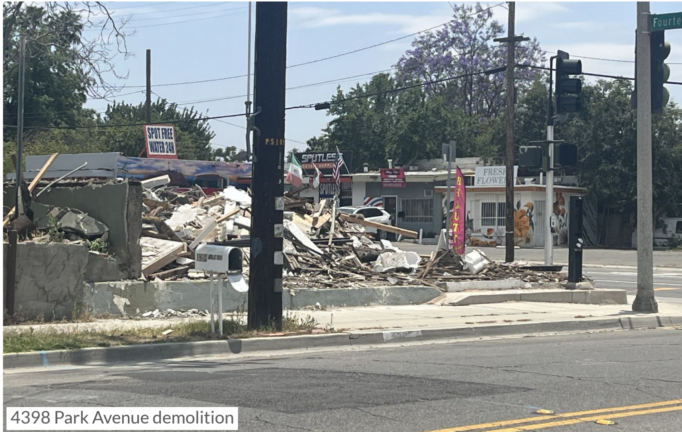
4398 Park Avenue demolition