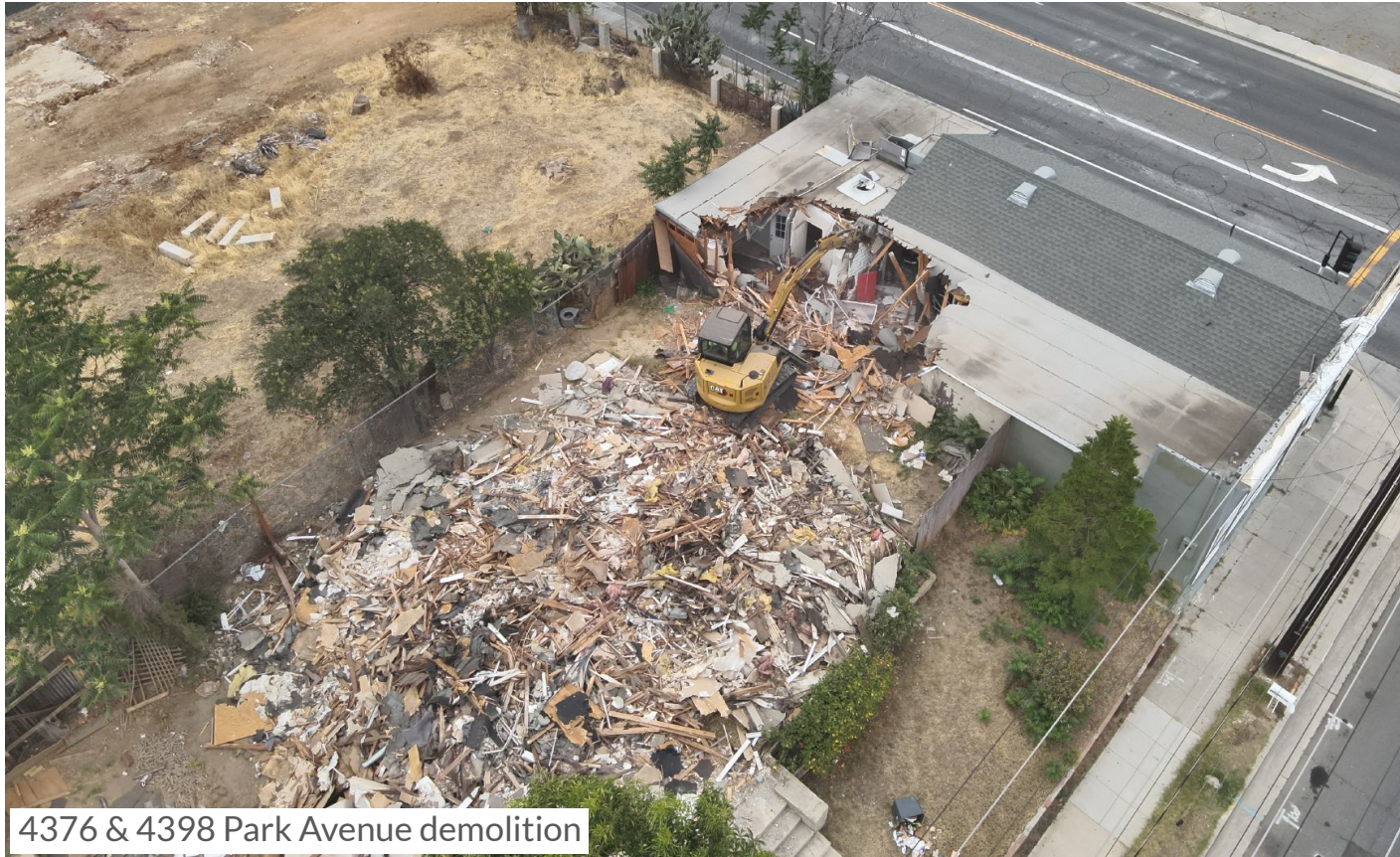
4376 & 4398 Park Avenue demolition