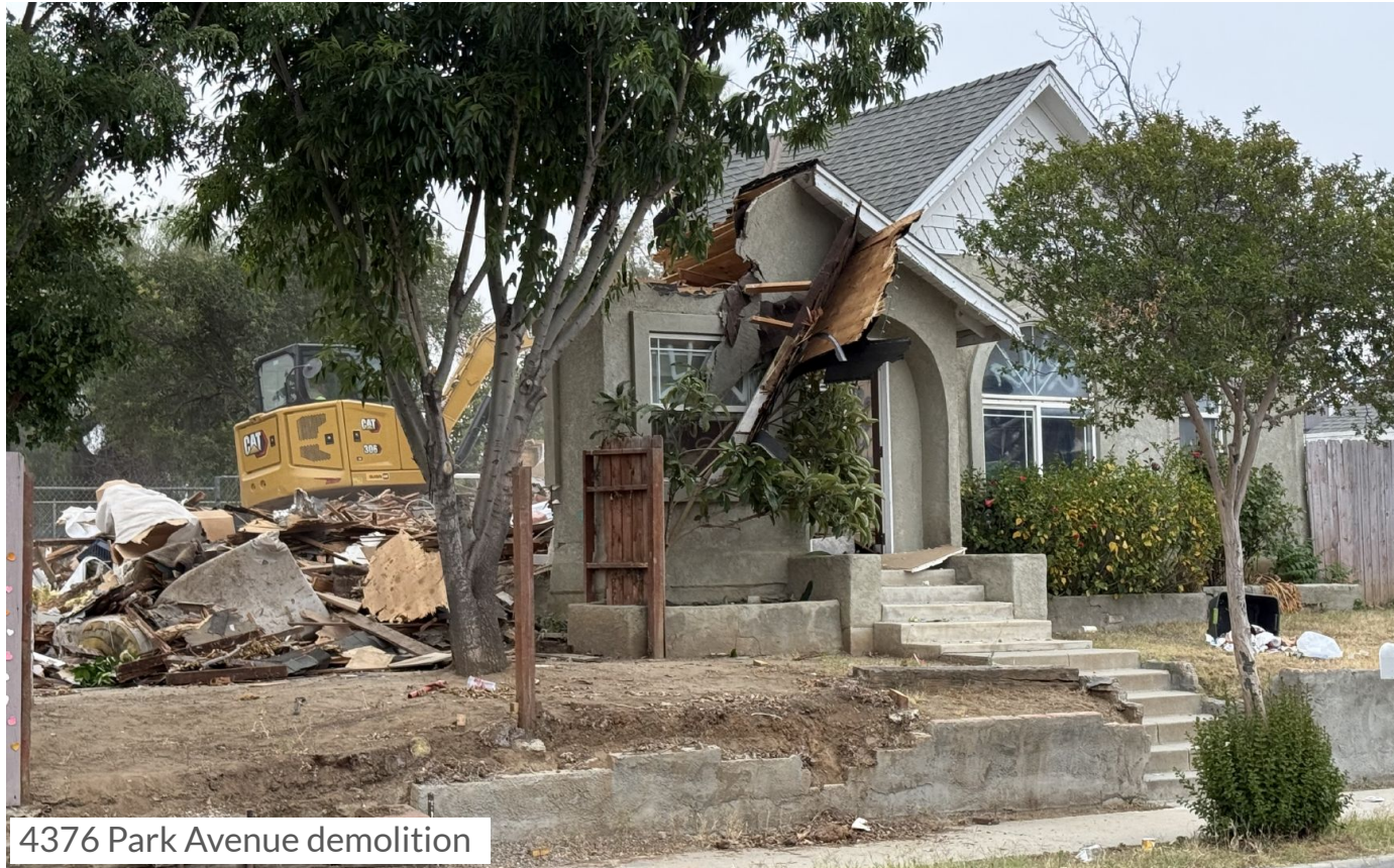
4376 Park Avenue demolition