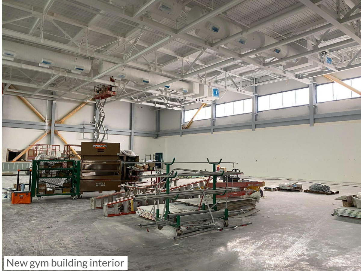
New gym building interior