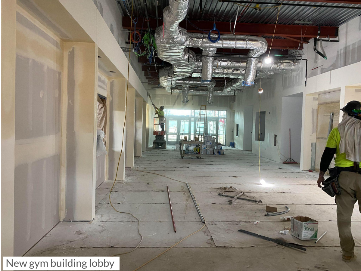
New gym building lobby