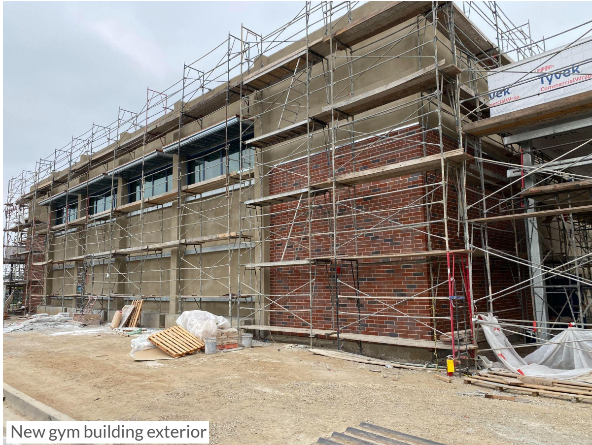
New gym building exterior