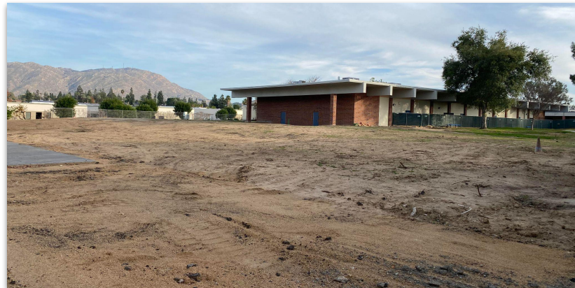
New 2-story science site - south view