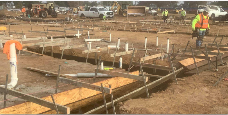
Building B form setting