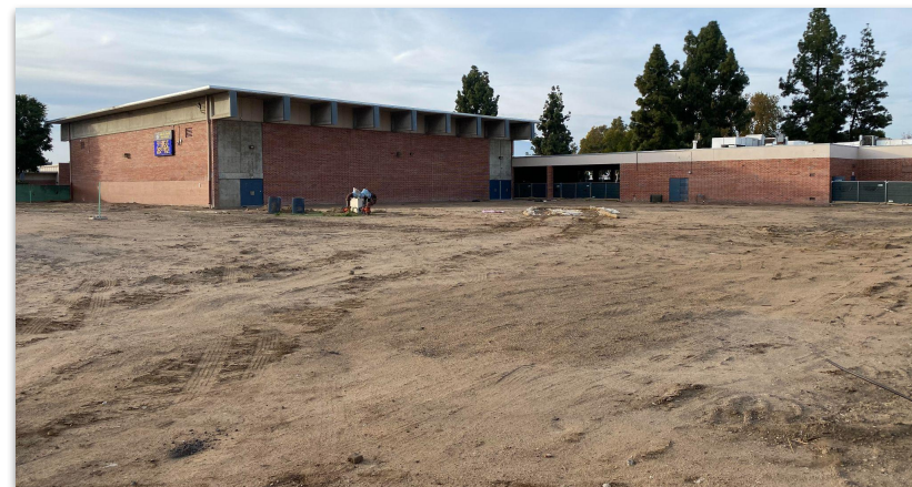
New gym building site - north view