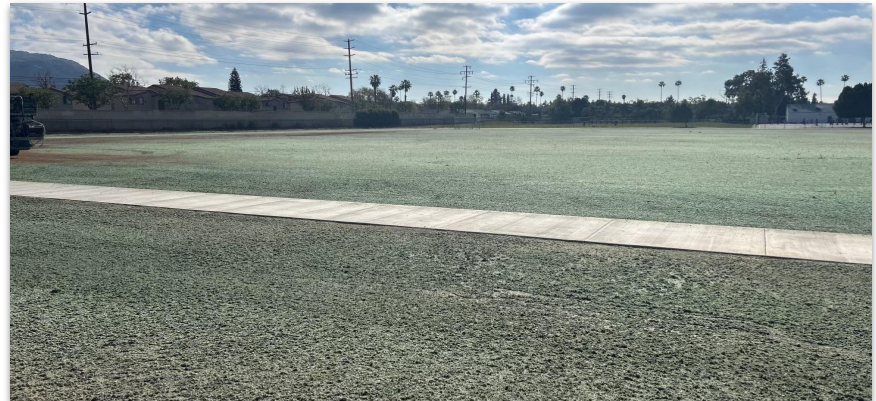
Playfield Hydroseeding completed waiting on germination