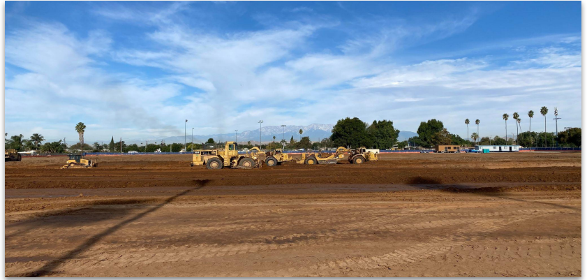
Site work soil over-ex, compaction, and grading