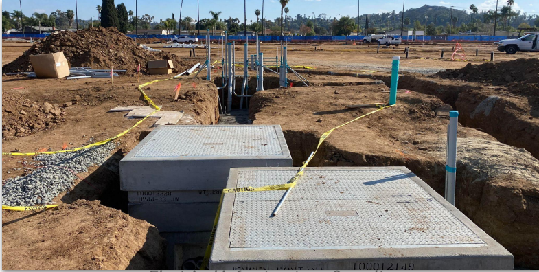
Electrical infrastructure & vaults