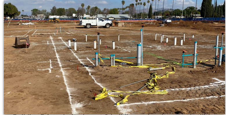
Building B foundation layout & building pad underground utilities