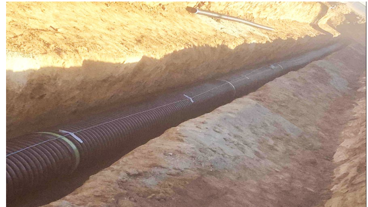
Storm drain installation