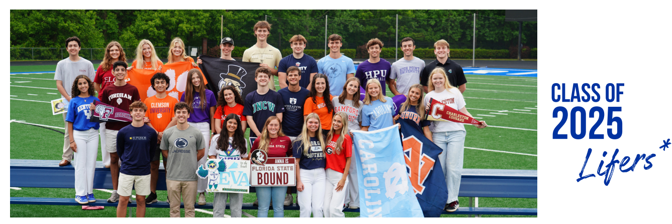
~ Honors Graduates * Lifers + Legacy Graduate