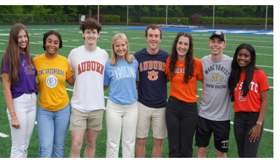
Head Prefect: Academics: Global Awareness:

Admissions: Fine Arts: Athletics: Spiritual Life: Student Life: