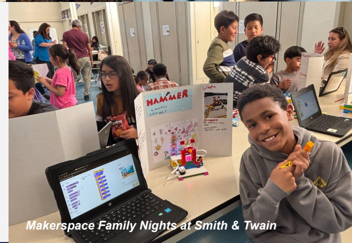
Makerspace Family Nights at Smith & Twain