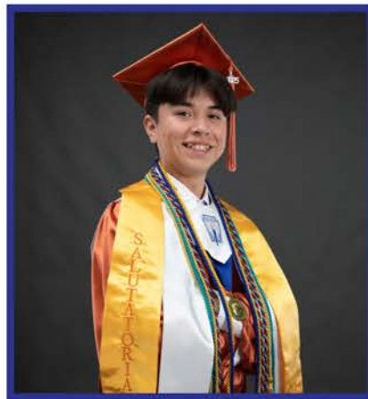
PSJA Collegiate SALUTATORIAN