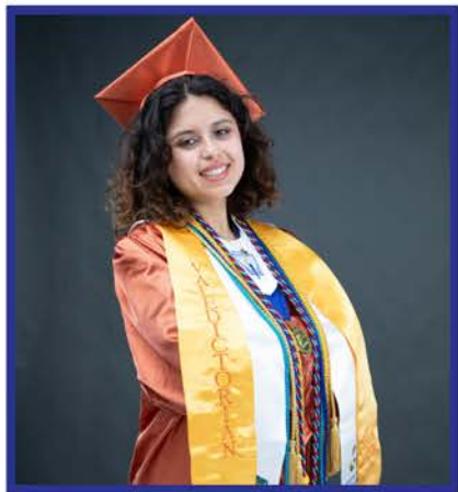
PSJA Collegiate VALEDICTORIAN