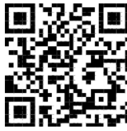
Search for troops in Appleton tinyurl.com/Appleton-Troops-4K-5

Get a headstart on all the amazing adventures Girl Scouts has to offer with our extended year membership*, availlable April 1 through July 31st. Find a troop or start your own, visit gsnwgl.org/join and choose extended year membership at checkout.