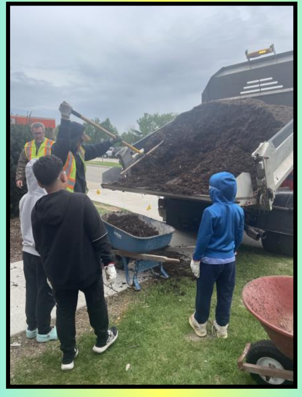
News from the AASD Birth-Five Outreach Program: