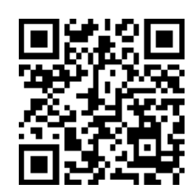
Girl Scout Experience Boxes tinyurl.com/Meet-the-GS-Experience-Box