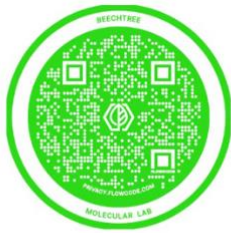
Anchorage School COVID Registration