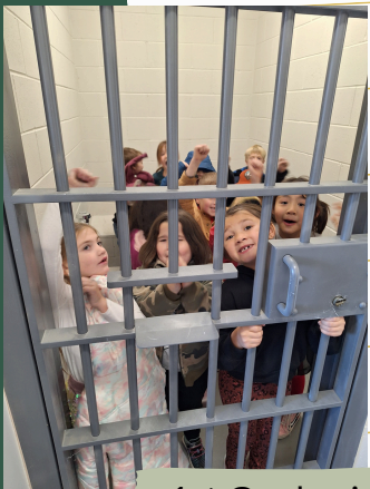
1st Grade visit to the police station