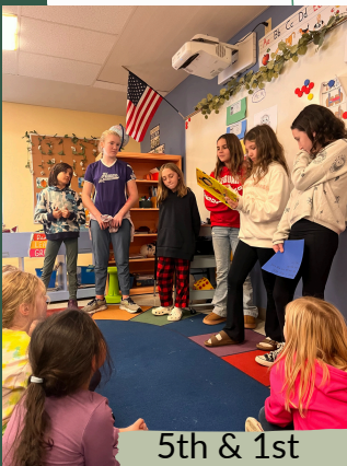
5th & 1st Graders

FRES Turkey Trot POSTPONED to Monday 11/25 due to forecasted rain