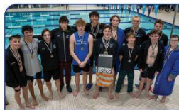
BOYS SWIM & DIVE