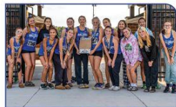
GIRLS CROSS COUNTRY