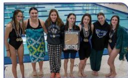
GIRLS SWIM & DIVE