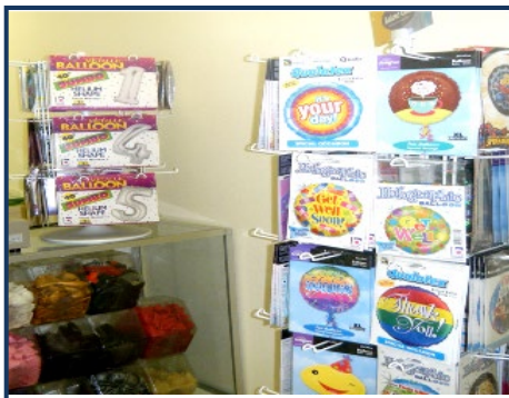
The EAHS Student Store has all of your school spirit wear, including PE Uniforms.

The typical student at Everett Alvarez High School is issued several hundred dollars' worth of textbooks. A student and his/her parents are responsible for these books and any library materials checked out. When a student loses or damages a book, the cost of the item is added to the student's financial bill. Students who owe money may be excluded from certain extra-curricular activities. Students will not participate in commencement exercises, nor will they receive their diploma, until their financial obligations have been cleared.