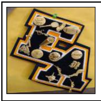
Above: EAHS Block Letter

Block letters can be requested for athletes who complete a season on a varsity team. A pin can also be requested to signify achievement in this area every year after the block is earned. If you have earned a block in athletics, please see the Athletic Director to request your block. Block letters can also be requested for some academic programs and achievements. Please contact the ASB Office to obtain information on the other qualifications.