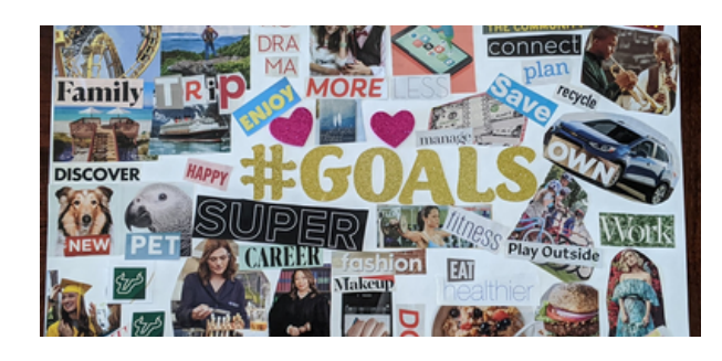
Students are enjoying creating Vision Boards displaying their interests and goals.