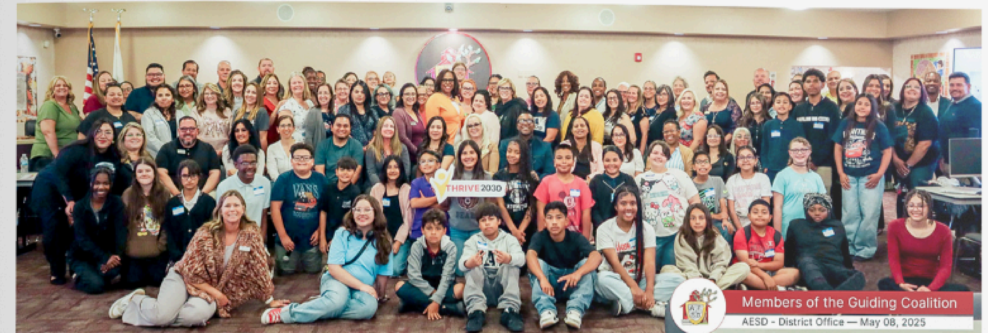
Members of the Guiding Coalition AESD - District Office — May 08, 2025