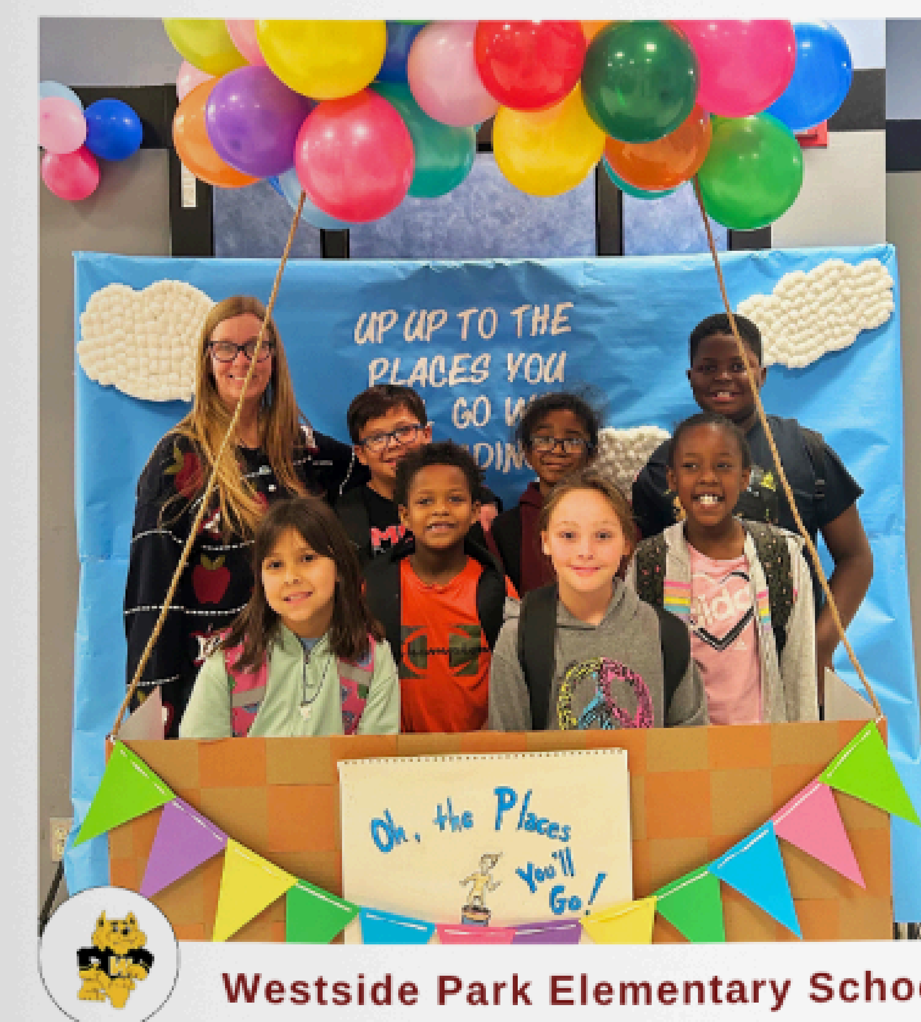
Westside Park Elementary School

Staff and school leaders regularly share updates to keep families connected and highlight how creativity drives student success. Together, the school community thrives through bold ideas and collaborative energy.