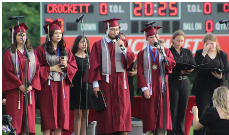
Above: The choir sings "I've Had the Time of My Life."