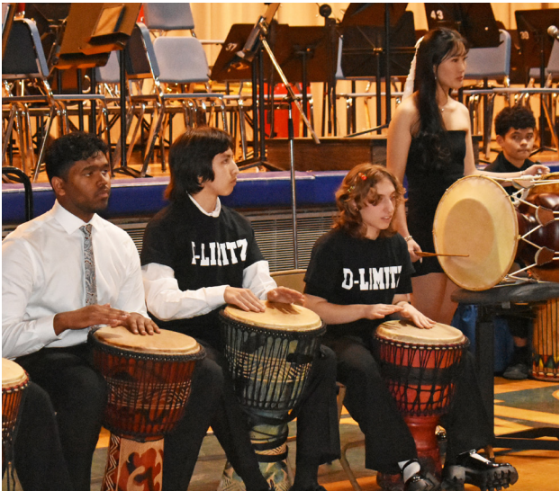
D-Limitz Band.