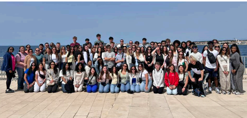
Pictured: All students and chaperones who went on the trip!

tour of the town, especially focusing on the famous but persecuting emperor Diocletian's ancient palace. Through this, the students could genuinely see and understand what it was like during his time and see a local's perspective. After spending the night in Split, they traveled to the Plitvice National Parks area via two cities, Trogir and Zadar. In Trogir, the students walked on the promenade and shopped. While in Zadar, they ate traditional Croatian lunch and visited the famous Sea Organ. Finally, the students arrived at the National Park, where they enjoyed a scenic hike through the lakes and waterfalls. A day later, they left the countryside for the hustle and bustle of Croatia's capital, Zagreb.