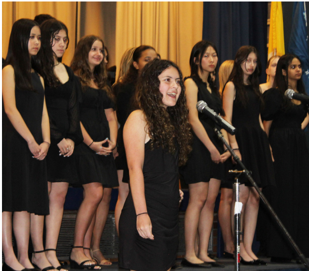
Freshman Chorus.