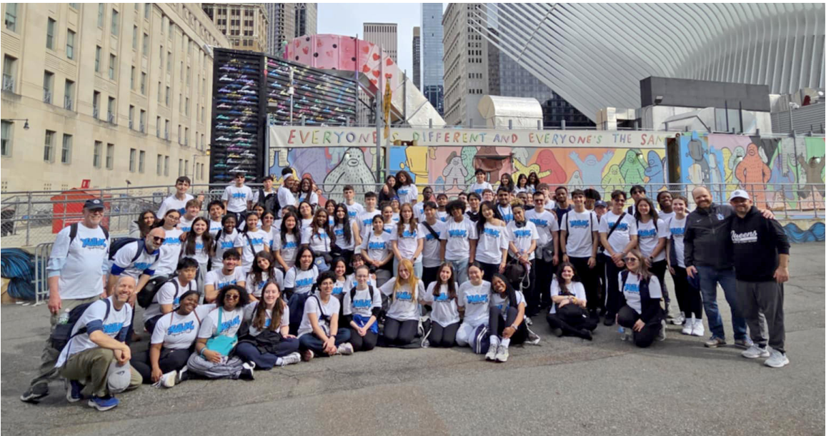
Seniors at the end of the Br. Leo World Trade Center Walk.