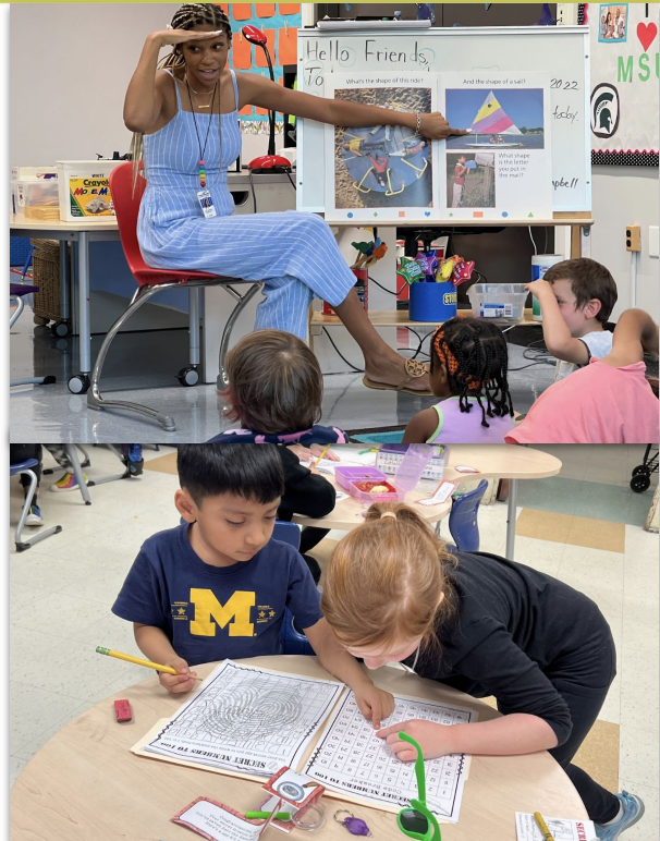
Summer Learning 2025 | Board of Education | May 21, 2025

What: Math & ELA English Learner Services Special Education Services