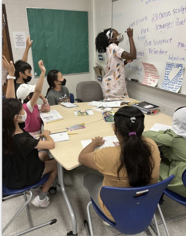
Summer Learning 2025 | Board of Education | May 21, 2025