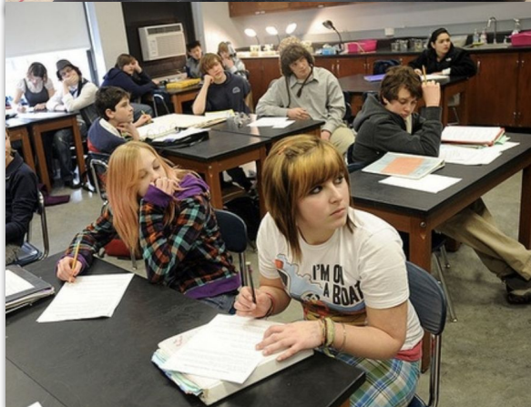
Summer Learning 2025 | Board of Education | May 21, 2025

What: Credit Recovery Breakfast, Lunch & Transportation Provided