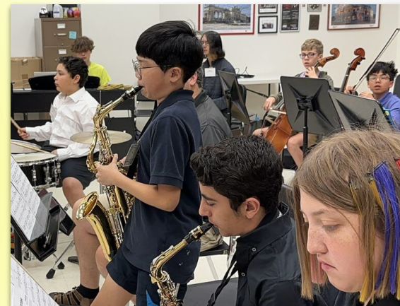
Summer Arts Program Fee-based with Scholarships 3rd - 12th