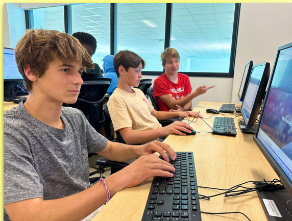
A2 Virtual+ Summer Session Fee-based 6th - 12th