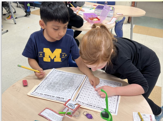
Elementary Summer Program Invitation Only K - 4th