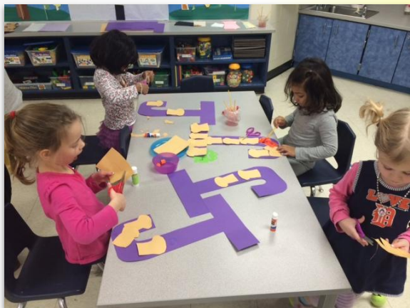
Extended School Year (ESY) Invitation Only All Grades