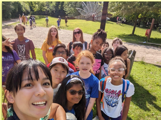
Middle School Summer Program 5th - 7th EL Bridge 8th Invitation Only