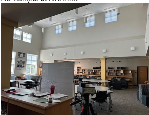
Air Sample in Library