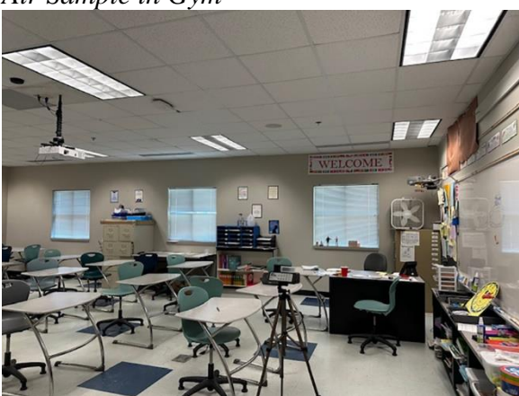
Air Sample in Classroom