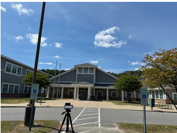
Air Sample Outdoor