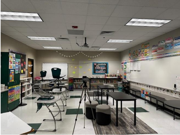
Air Sample in Classroom