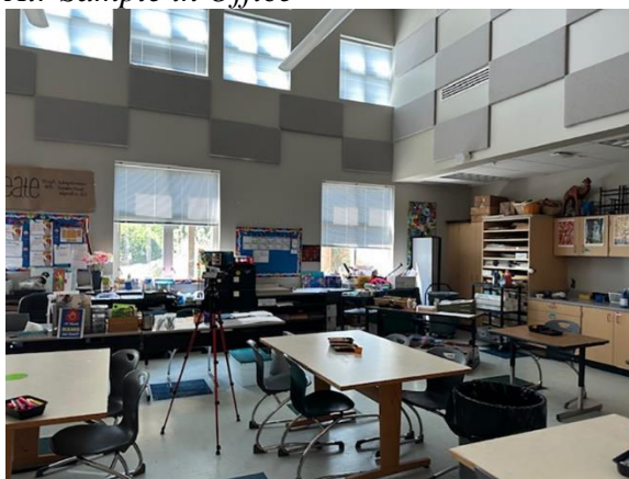
Air Sample in Artroom