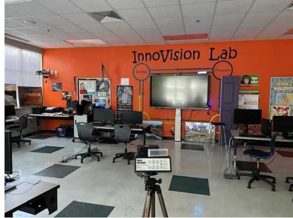
Air Sample in Lab