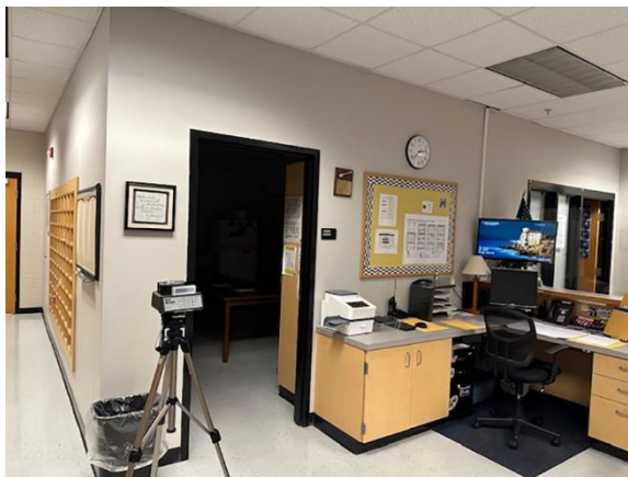
Air Sample in Office