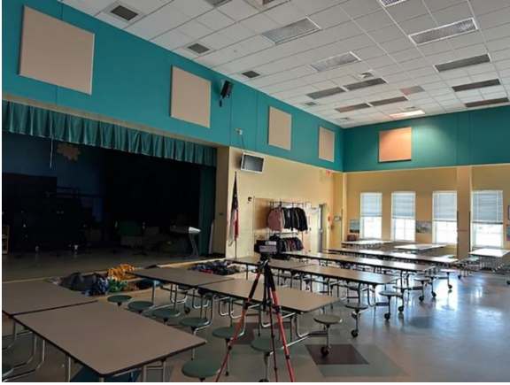
Air Sample in Cafeteria