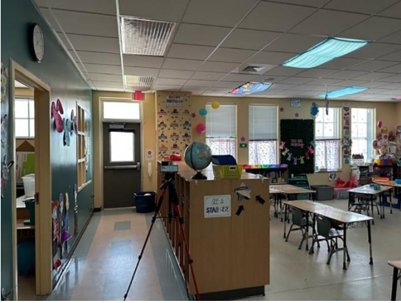
Air Sample in Classroom