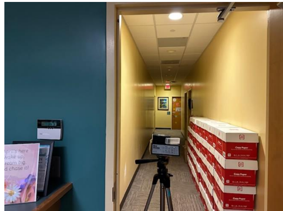
Air Sample in Office