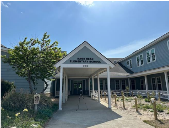
Air Sample Outdoor