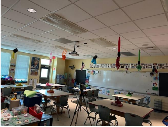
Air Sample in Classroom