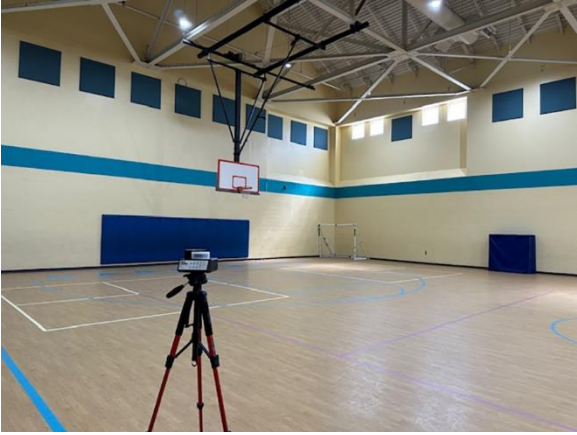
Air Sample in Gym