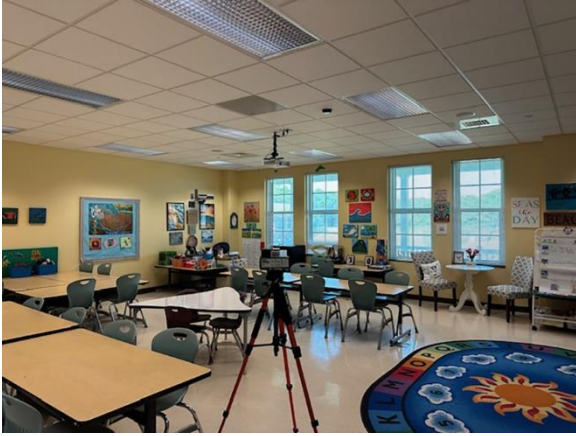
Air Sample in Classroom