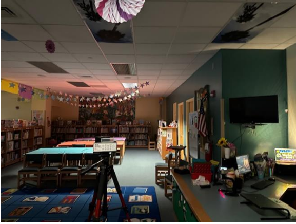
Air Sample in Classroom