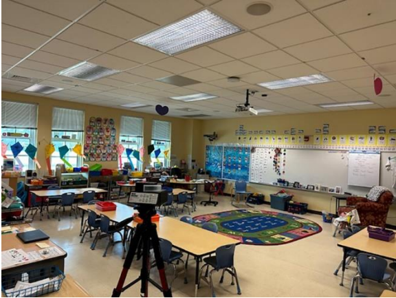
Air Sample in Classroom