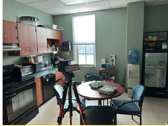
Air Sample Lounge