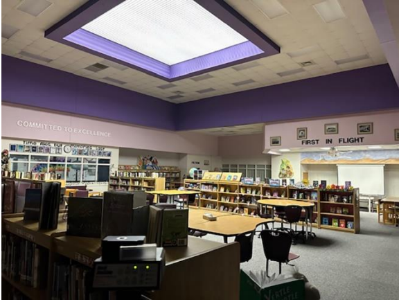
Air Sample in Media Center