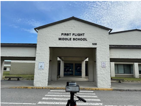
Air Sample in Outdoor