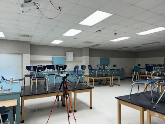
Air Sample in Classroom