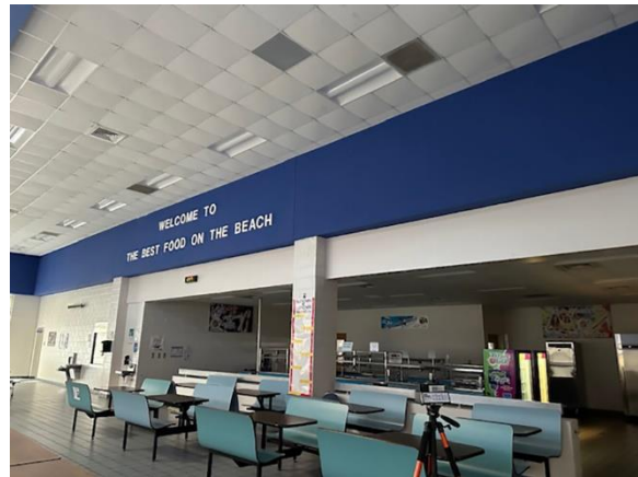
Air Sample in Cafeteria