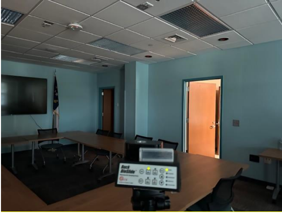
Air Sample in Conference Room