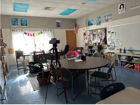
Air Sample in Classroom