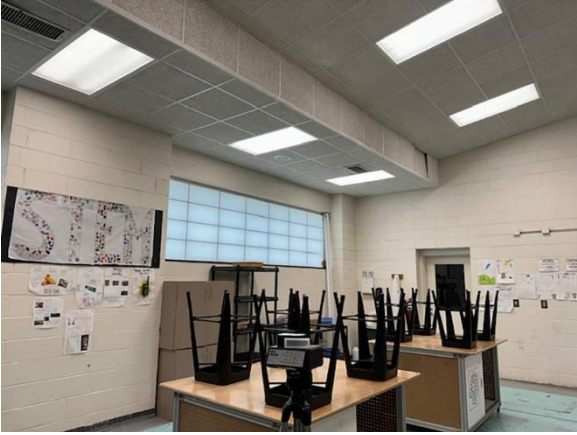
Air Sample in Classroom