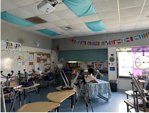
Air Sample in Classroom