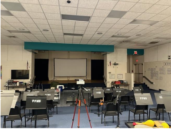
Air Sample in Music Room