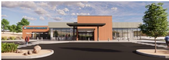
Pueblo North scheduled to open late 2025