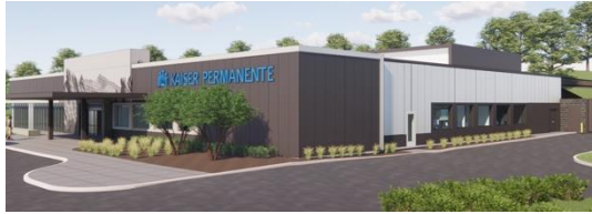
Parker scheduled to open late 2025