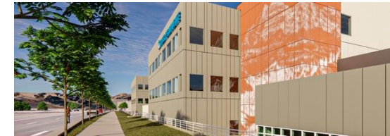
Lakewood scheduled to open spring 2026