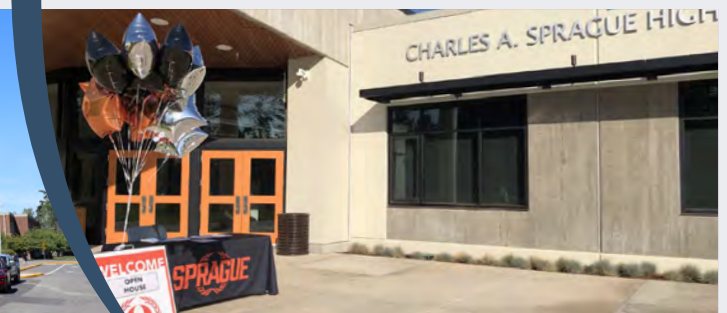
SPRAGUE - New secure front entry