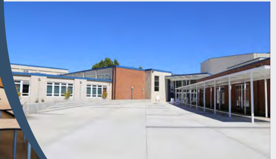
McNARY - New secure front entry