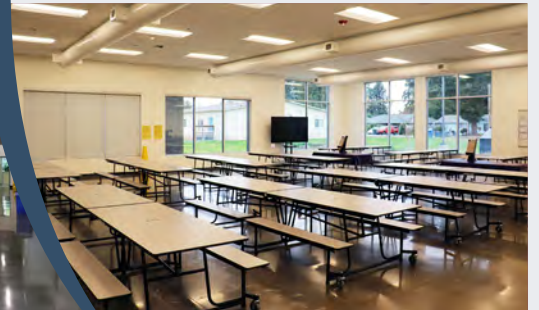
KENNEDY - New cafeteria