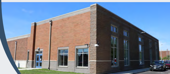
HOUCK - Cafeteria expansion