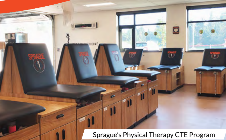
Sprague's Physical Therapy CTE Program