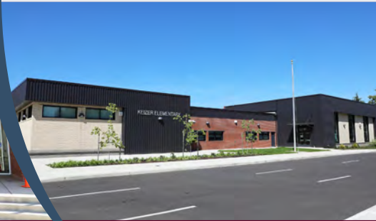
KEIZER - Classroom, cafeteria and multipurpose fitness room wing