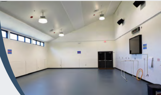
HOOVER - New multipurpose fitness room and classroom