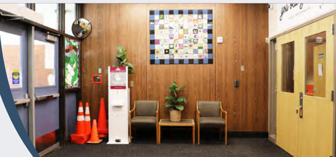
SCHIRLE - Secured vestibule and a new classroom