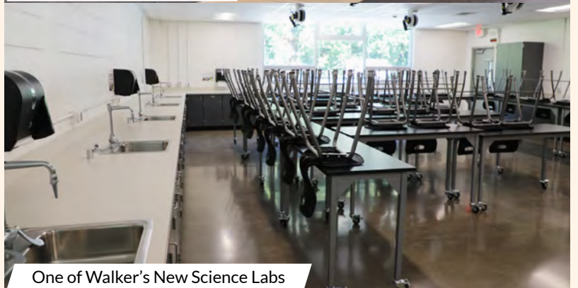
One of Walker's New Science Labs