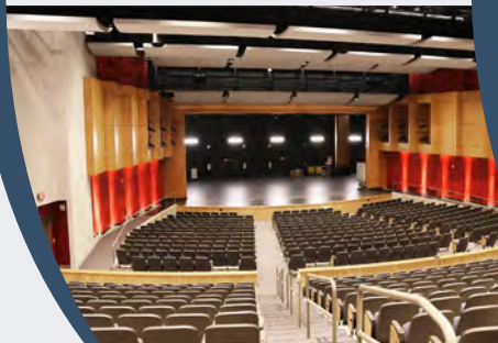
SOUTH - Rose auditorium