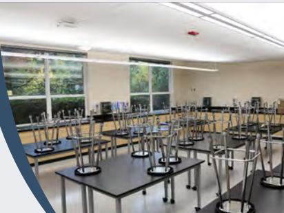
CLAGGETT - New science lab