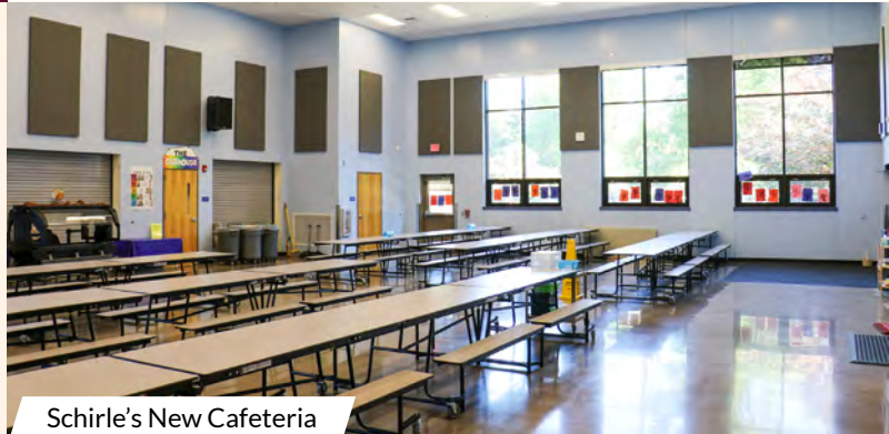
Schirle's New Cafeteria