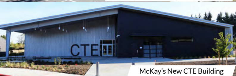
McKay's New CTE Building