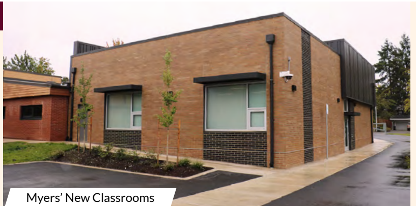
Myers' New Classrooms