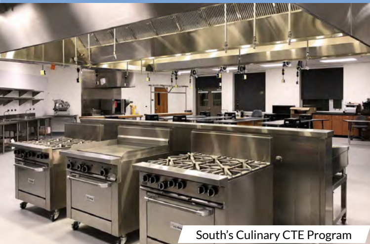
South's Culinary CTE Program