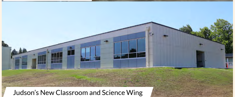
Judson's New Classroom and Science Wing

*Houck Middle School is part of the South Salem and North Salem High School feeders, and Judson Middle School is part of the South Salem and Sprague High School feeders.