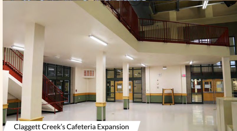
Claggett Creek's Cafeteria Expansion