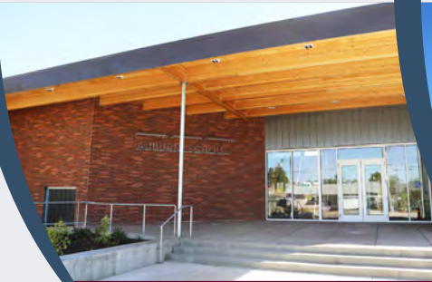
AUBURN - New secure front entry