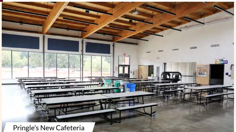
Pringle's New Cafeteria