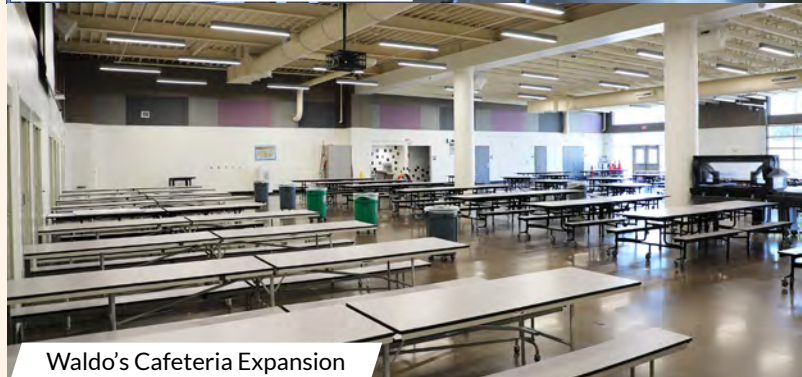
Waldo's Cafeteria Expansion

*Waldo Middle School is part of the McKay and North Salem High School feeders.