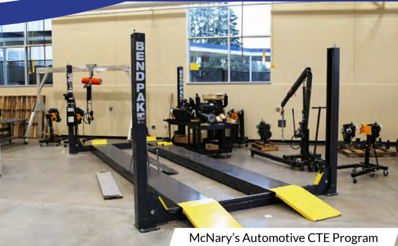
McNary's Automotive CTE Program