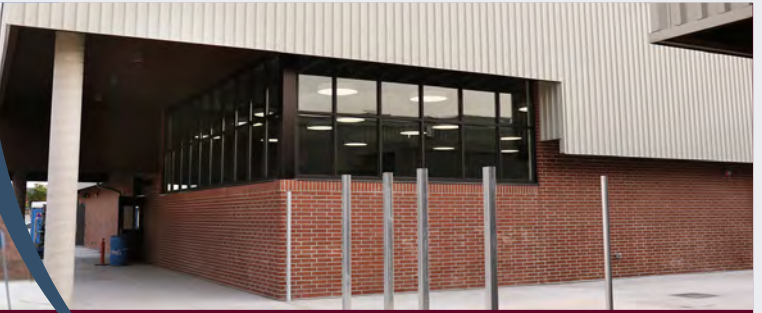
SCOTT - New classroom and cafeteria wing