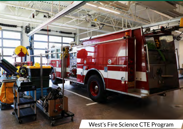
West's Fire Science CTE Program