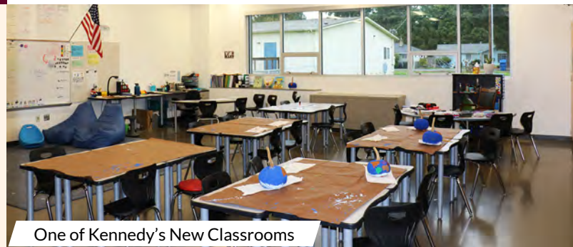
One of Kennedy's New Classrooms