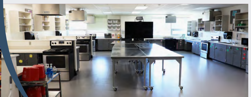
WALKER - Foods lab