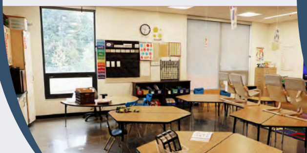
PRINGLE - New classroom