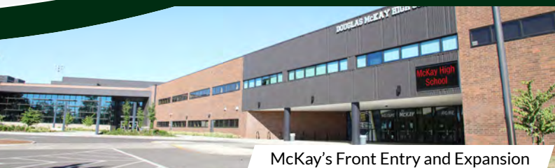
McKay's Front Entry and Expansion