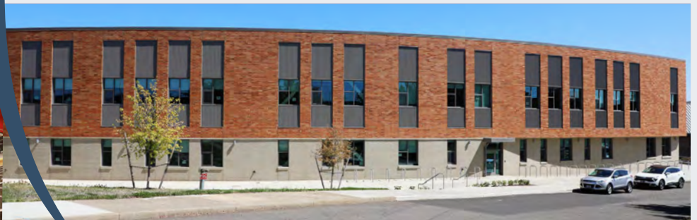
WEST - New classroom, CTE and special education wing