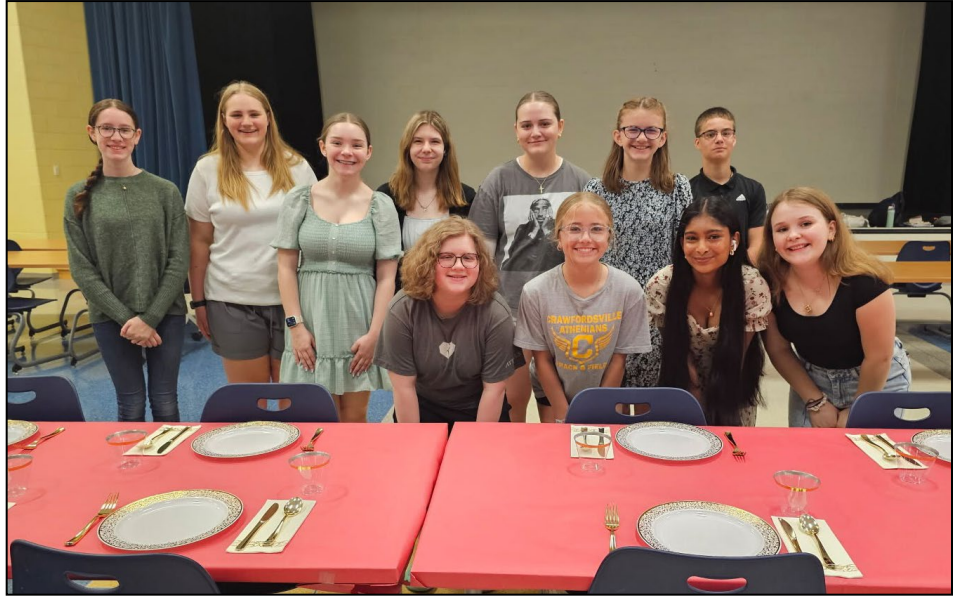
The ATEAM planned and served a special meal to the Crawfordville Middle School Support Staff to express their appreciation for the work they do at CMS.