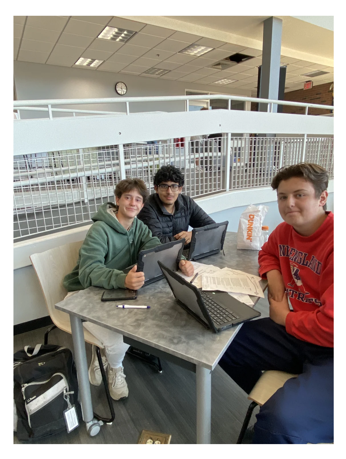
Barnstable Future Problem Solving students working to solve a practice problem.