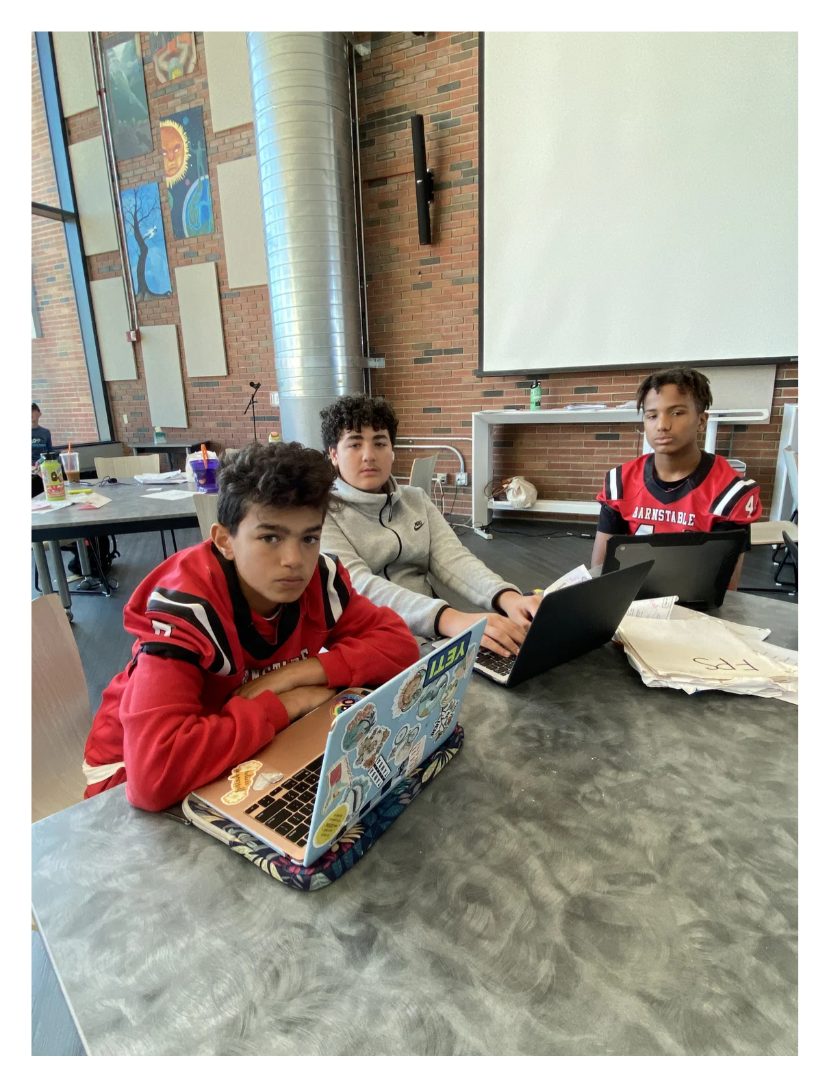
Barnstable Future Problem Solving students working to solve a practice problem.