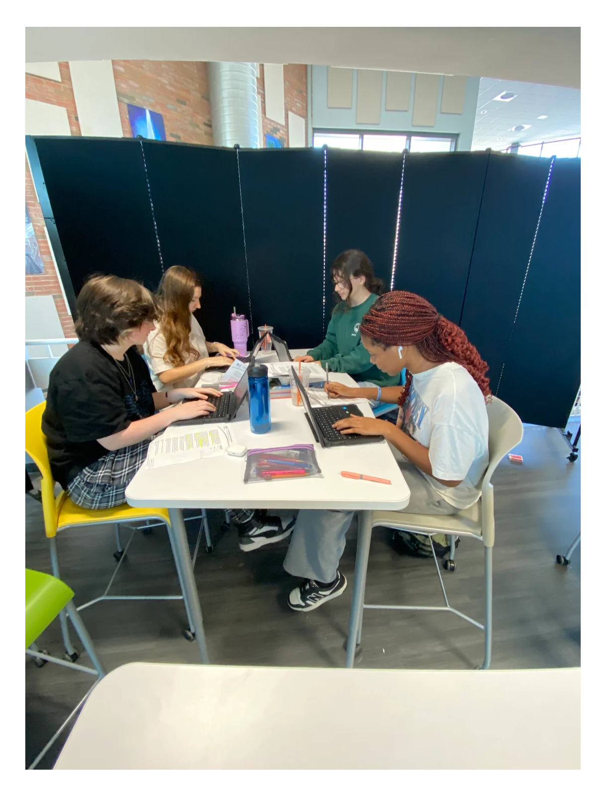
Barnstable Future Problem Solving students working to solve a practice problem.