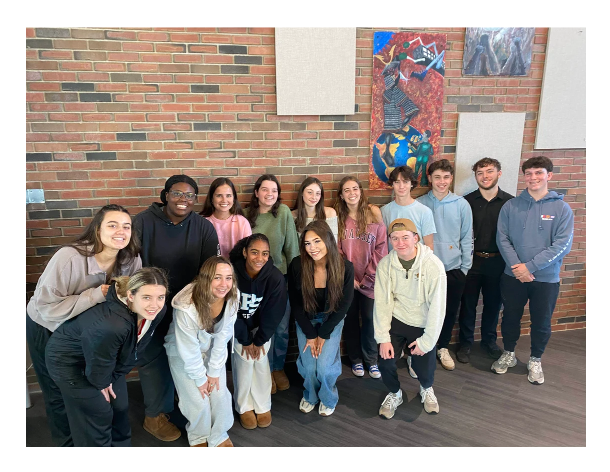
Barnstable Future Problem Solving senior competitors.