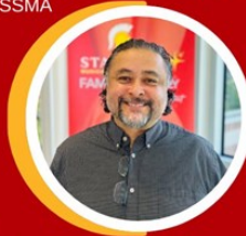
Alfred Black SHS