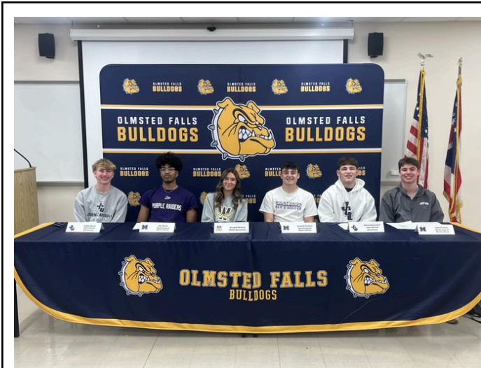
Some of our student athletes on signing day!