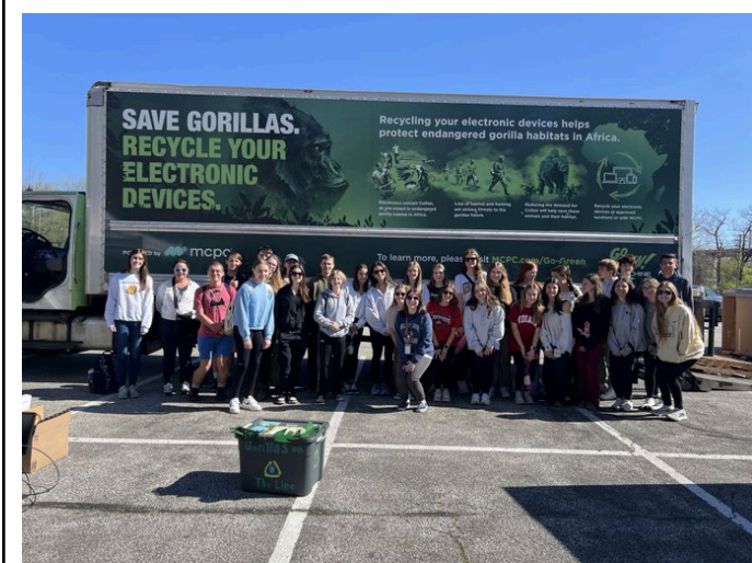
CCP Bio at the Zoo with their electronics recycling