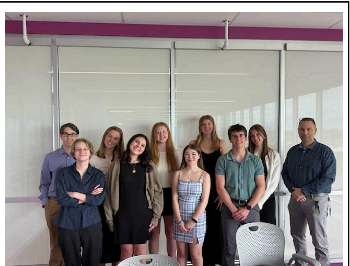
AP Research kids on their presentation day