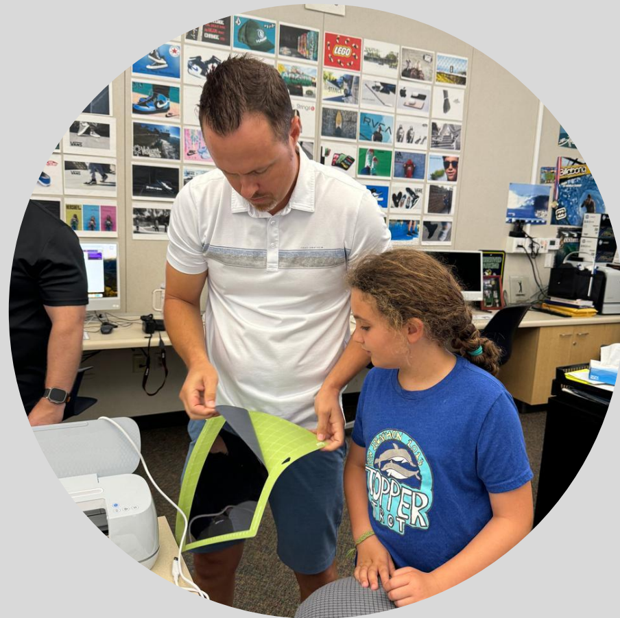
Skill Development & Enhancement