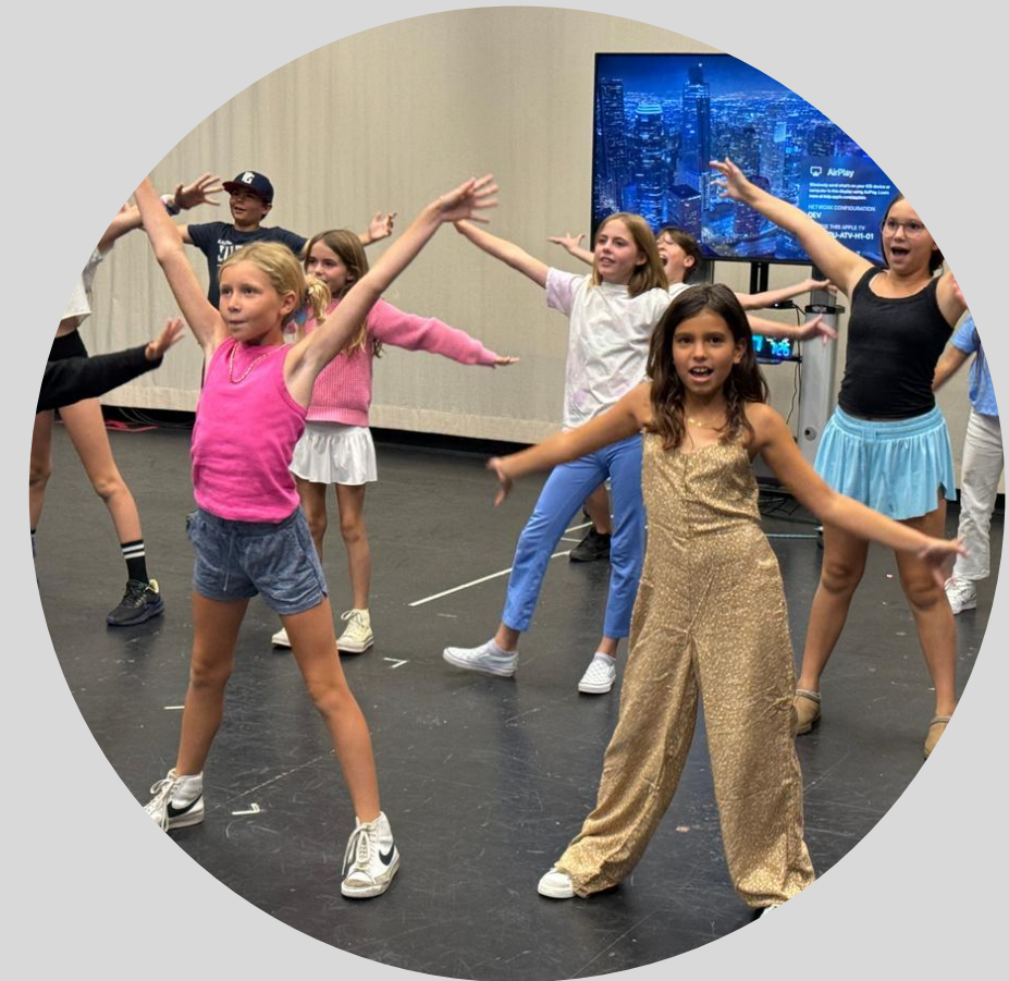
Confidence & Empowerment