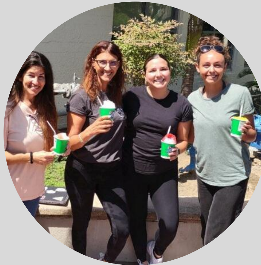
Engagement & Social Connections