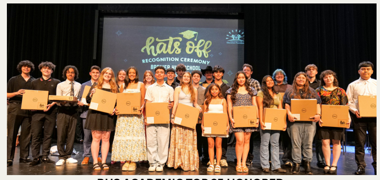
BHS ACADEMIC TOP 25 HONORED BY WSISD EDUCATION FOUNDATION