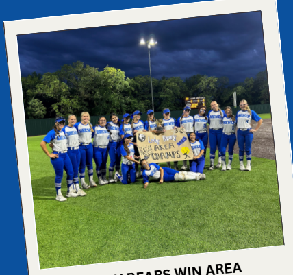
LADY BEARS WIN AREA CHAMPIONSHIP, ADVANCE TO REGIONAL SEMI-FINALS