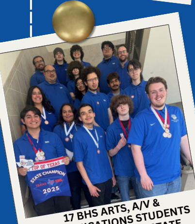
17 BHS ARTS, A/V & COMMUNICATIONS STUDENTS PLACE IN TOP 10 AT STATE