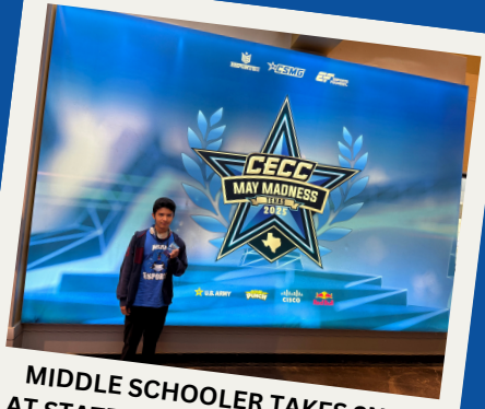
MIDDLE SCHOOLER TAKES 2ND AT STATE ESPORTS COMPETITION