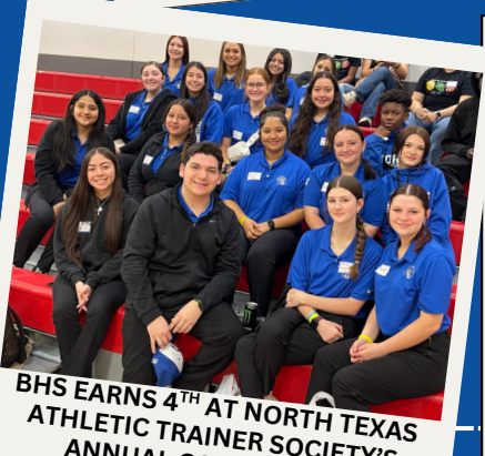
ATHLETIC TRAINER SOCIETY'S ANNUAL COMPETITION