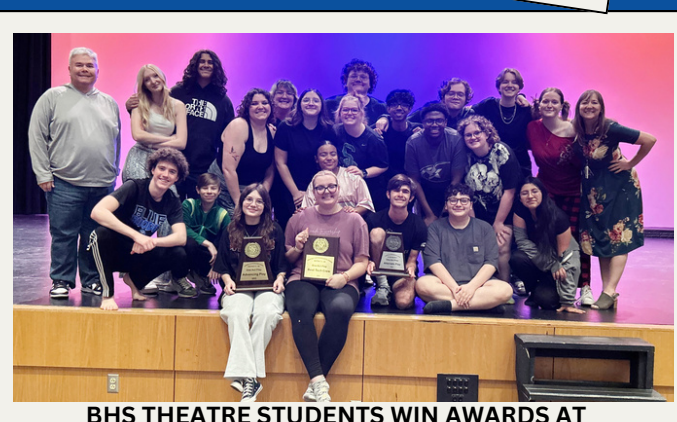
BHS THEATRE STUDENTS WIN AWARDS AT BI-DISTRICT UIL COMPETITION