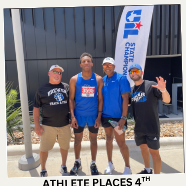
ATHLETE PLACES 4TH AT UIL STATE TRACK MEET