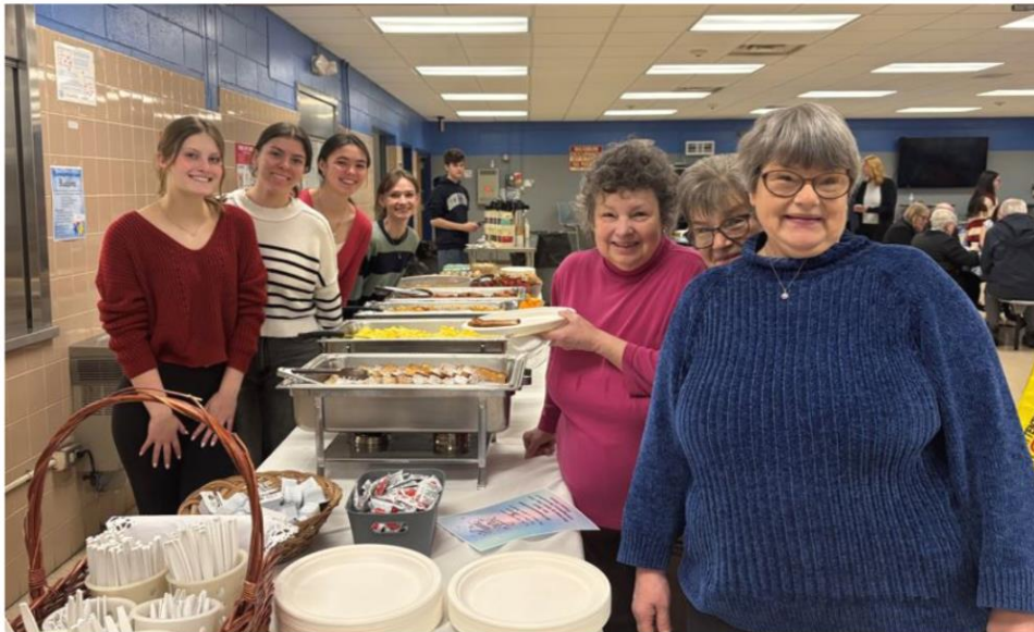
Senior to Senior Breakfast