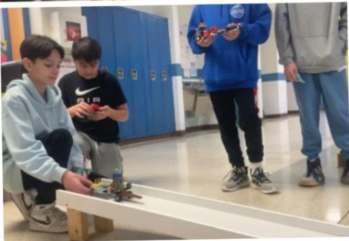
FCCLA Nationals Bound!