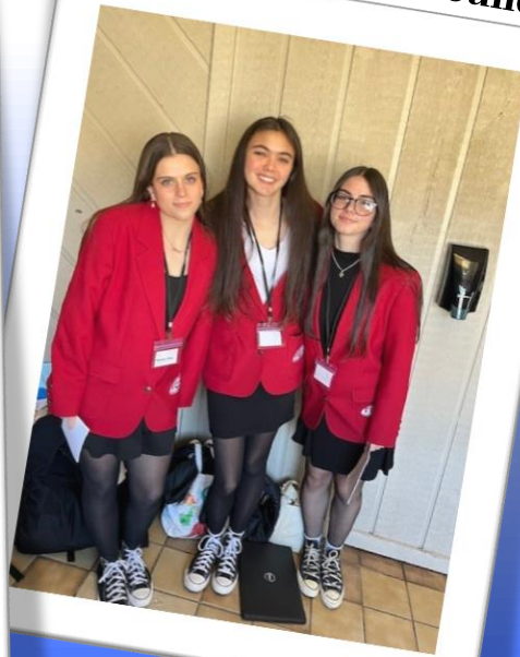
FCCLA Nationals Bound!