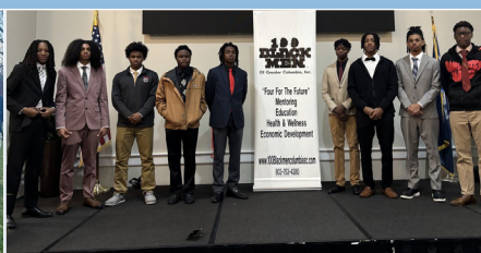
100 Black Men Lunch Buddies