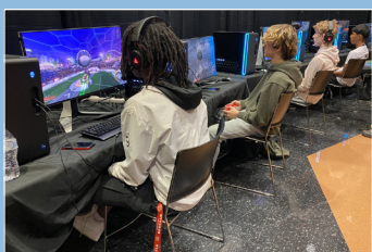
E-Sports (new in 2024-2025)