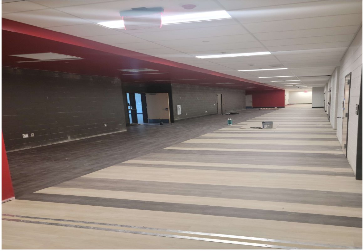
Page 6 5/6/2025