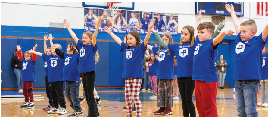
Fort Edward Elementary students delighted the community with their recent PE show, featuring lively dance and sports routines.

It is our intention to create bids for contractor review and bidding in the fall of 2025 with construction starting in the early spring of 2026. This timeline is longer than most capital projects but Fort Edward needed to space out the phases in order to take advantage of a previous project coming off the books so we could fully fund the new project. In the end, everything the community voted to be approved will be built or renovated. We appreciate everyone's patience so we can fund the project appropriately. In the end, it will be well worth the wait.