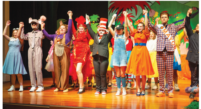
Horton Hears a Hit! Students dazzle audiences with their vibrant production of “Seussical the Musical,” bringing the whimsical world of Dr. Seuss to life.

As an organization, if we can follow the priorities, and do so within a fiscally responsible manner, the results of our '25-'26