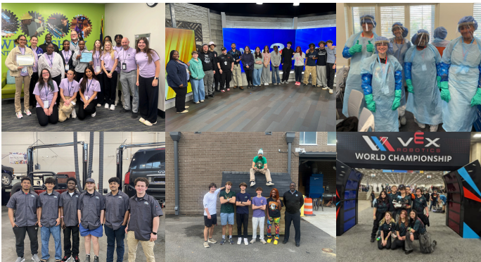
* THE WEST ASHLEY CAS IS HOME TO THE FIRST HIGH SCHOOL-CERTIFIED WELDING TESTING FACILITY IN SC!