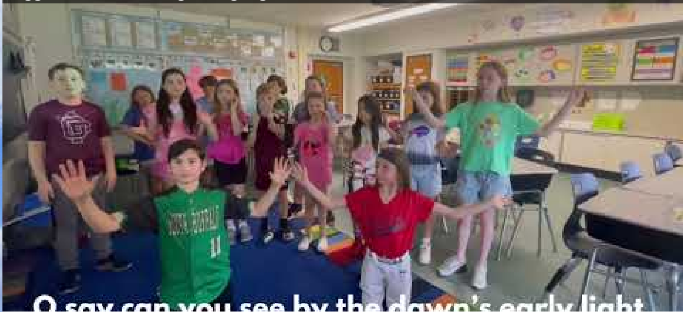
Eggert's American Sign Language Club

In addition to cultural knowledge, students acquired practical ASL skills, learning basic signs such as greetings, the alphabet, food, sports, and colors. The club concluded on a high note with students learning to sign the National Anthem. Please check out the video below to see the students perform what they learned and demonstrate some of their favorite signs.