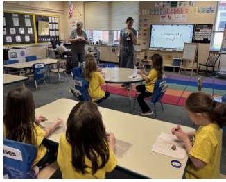
Under The Horizon