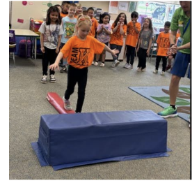
Empower Martial Arts