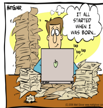
Resume not Autobiography

This is easy if you remain in the same line of work, but critical if you are changing careers. Emphasize any applicable skills that made you successful in your last position. They will serve as evidence of your ability to perform and succeed. Include paid experience in addition to volunteer work or hobbies. It does not matter where you gained the experience. The focus is on proving your abilities