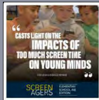
Screenagers Presentation and SIC roundtable discussion for upcoming initiatives.

Carolina Park Elementary was proud to partner with Wando High School and various CCSD schools of Mt. Pleasant to sponsor a presentation of Screenagers on March 31st. The event provided an informational film about our young learners' use of screens (cellphones, online games, etc.) and the importance of supporting the mental health and well-being of our youth. Audience members had an opportunity to engage with a panel of experts who shared their expertise about screens, resources, and tips on how we can balance the use of screens in our daily lives. We are excited to share ways we are implementing mindfulness to our technology usage, whether this be through social media, cell phone usage, gaming, and television. -As a student body, we will pledge on a monthly basis with rotating themes each month to limit screen time usage. -During the week of April 28th, we will kick it off by pledging no screen time during dinner. This can be tailored to your family's household.