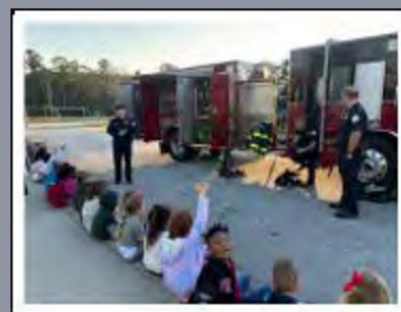
The Guidance Department provided Touch A Truck for grades K-2