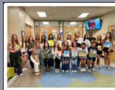
Carolina Park Elementary was happy to welcome Wando's Book Buddies club